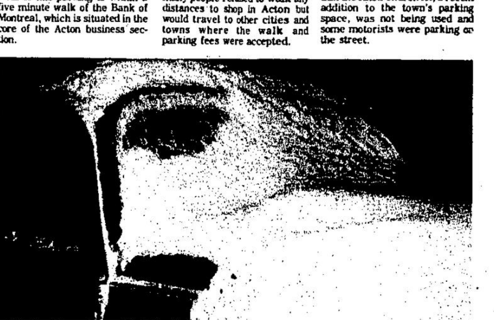
SNOW CAME FIRST, followed by sleet and rain and then high winds which blew clouds over and the sun shone Wednesday morning.

The discussion started when members of council observed that the Knox Church lot, a recent addition to the town's parking space, was not being used and some motorists were parking on the street.