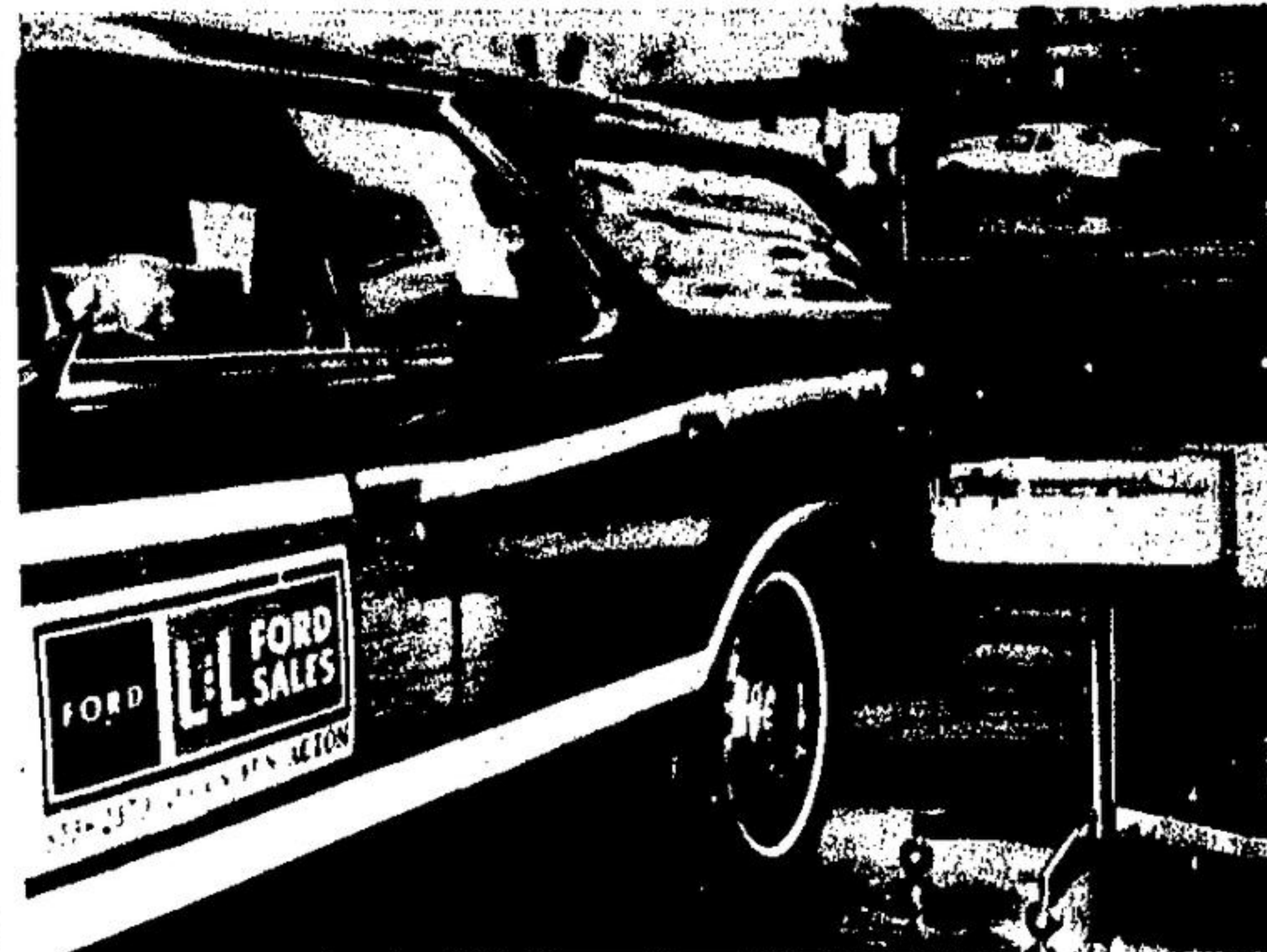
VIDEO-TAPE EQUIPMENT at L & L Ford of car without leaving showroom. Sales allows customers to view performance.

Ron Ellis, star right winger of the Toronto Maple Leafs and Team Canada, is moving to Georgetown next month.