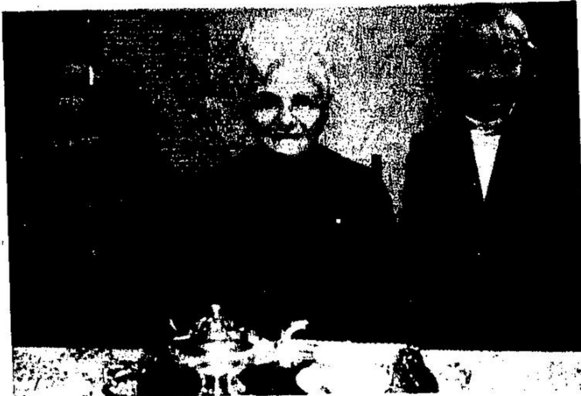
Tea time in the village