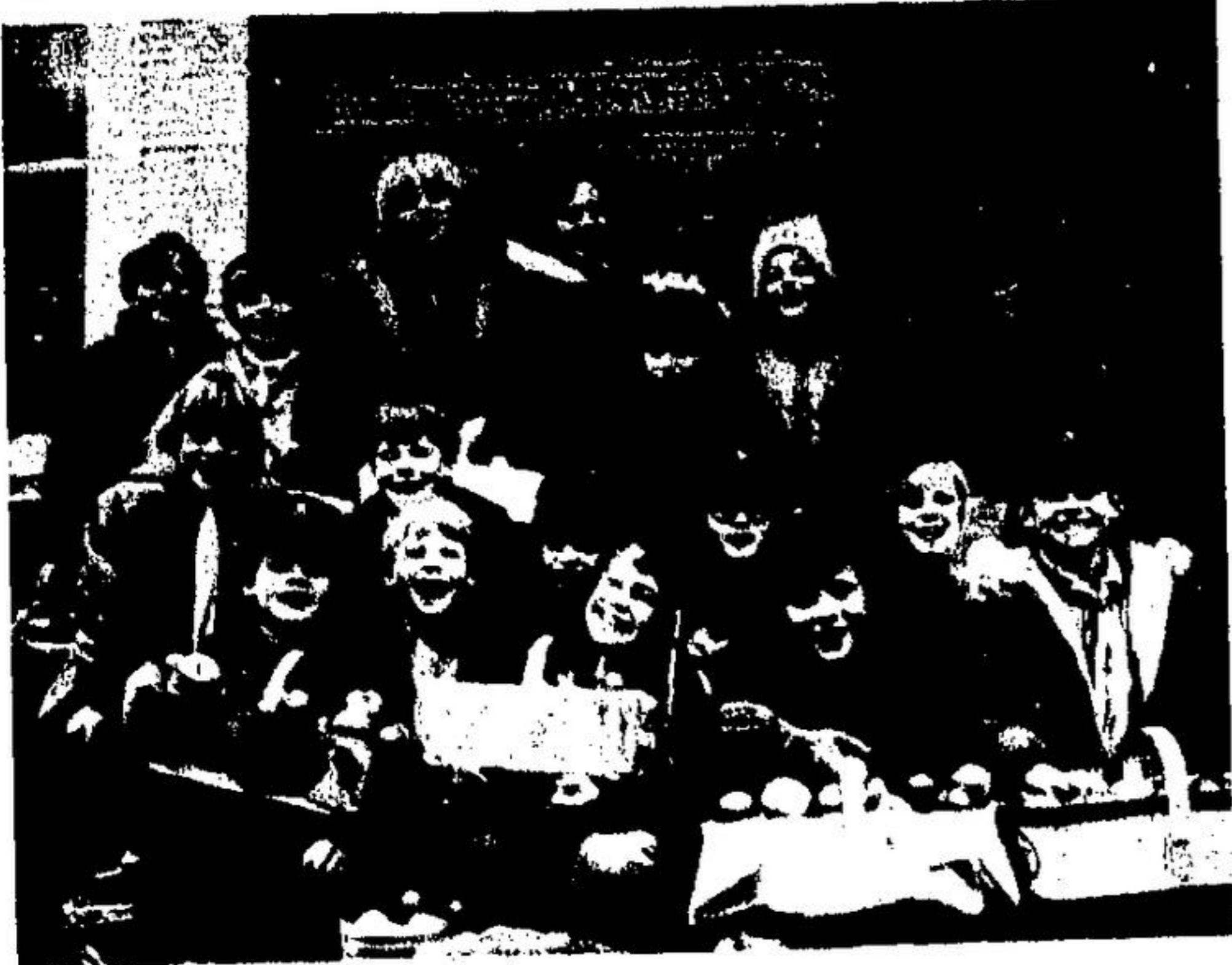
TWENTY-FIVE CUBS and scouts set out in the drizzle last Saturday morning to sell pre-polished shiny red apples from the elegantly decorated baskets which they had worked on themselves. Fun and effort and they had a wonderful time transported by leaders to