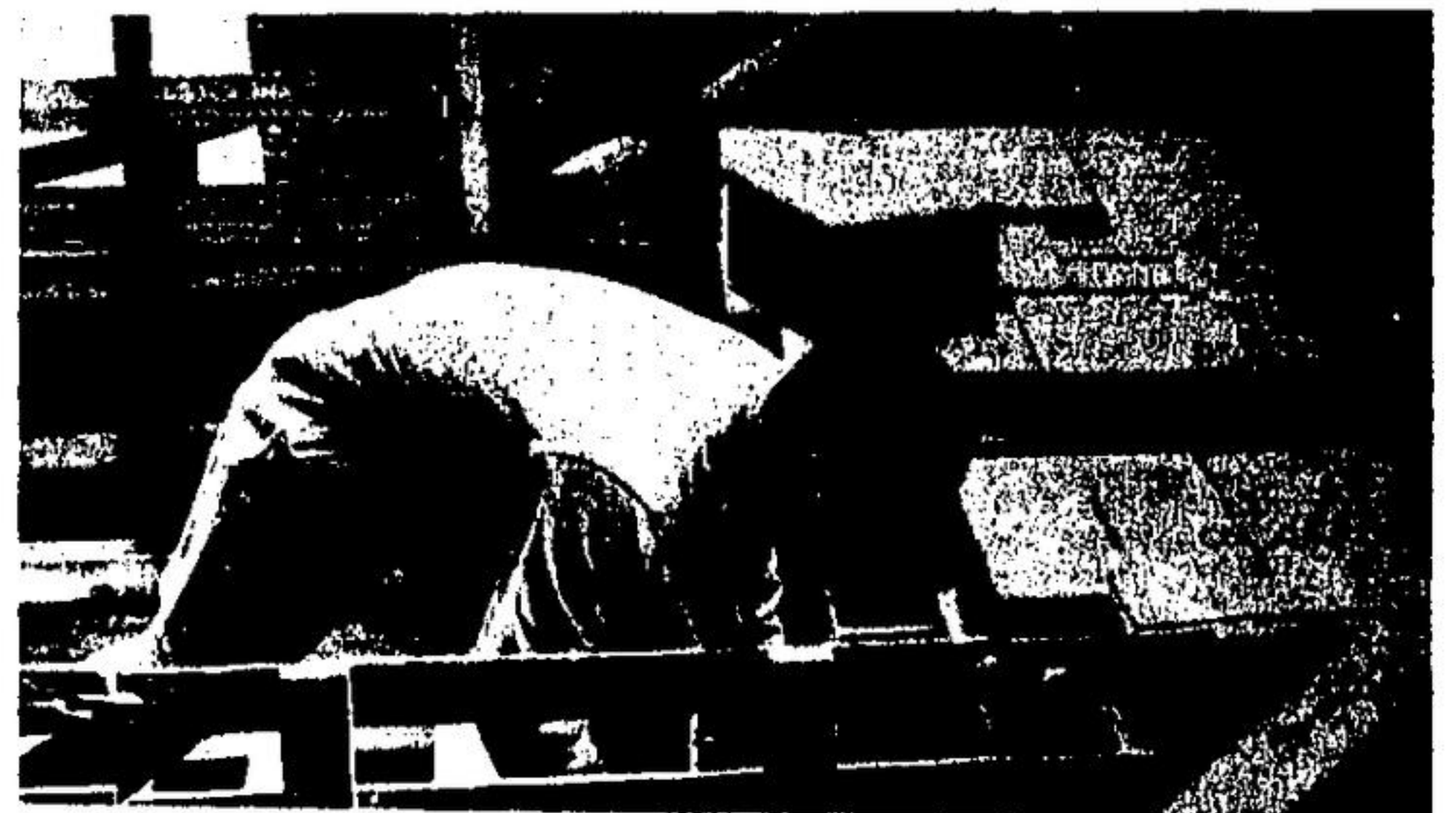
THREE TON truck is loaded with 232 cases of stores. Acton O.P.P. laid charges and more canned goods, seized by police at two Acton homes, two Acton stores and four out-of-town police are pending.

Acton police informed Milton detachment of the O.P.P. and the Toronto Harbor Commission police. The port police are still investigating and it is understood four more persons are being charged there as a result of the investigation.