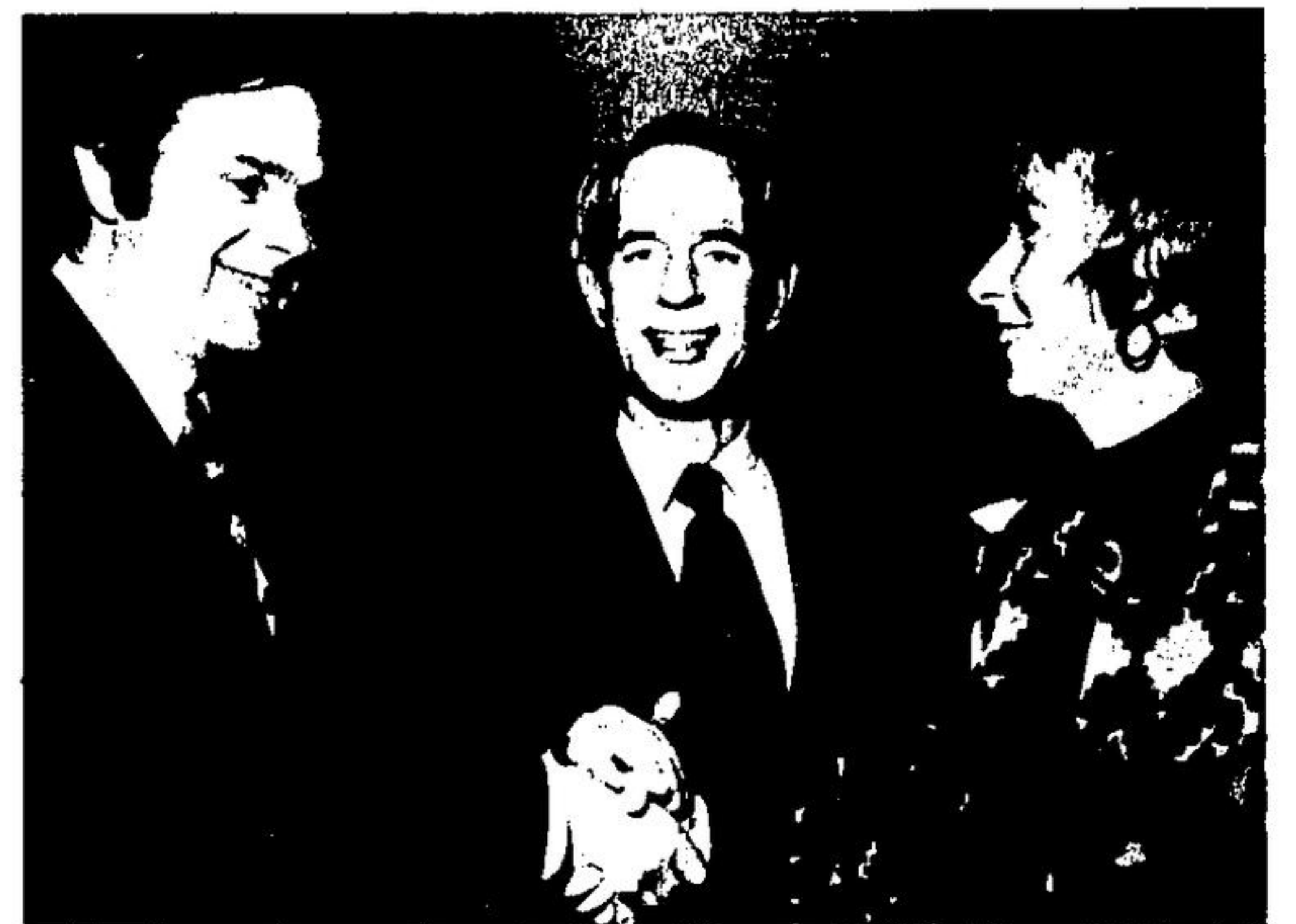
Shake . . . and come up fighting