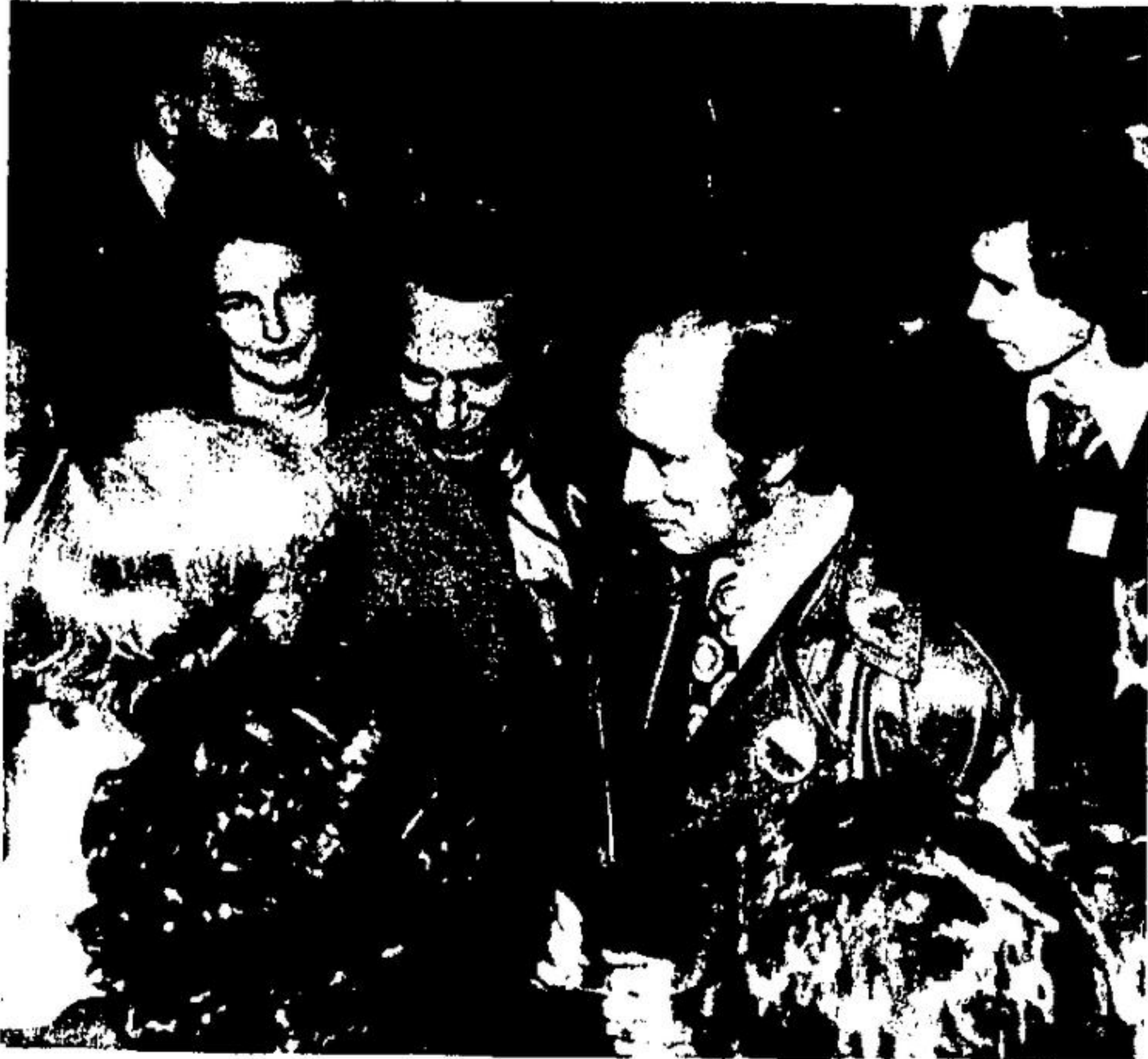
MR. TRUDEAU came to Oakville Saturday and took the town by storm in a brief two and a half hour visit.

Throughout his brief talk the demonstrators, carrying signs protesting unemployment and the Asian workers' quota, shouted at Trudeau and tried to disrupt his speech. "Jobs yes, Trudeau no, unemployment's got