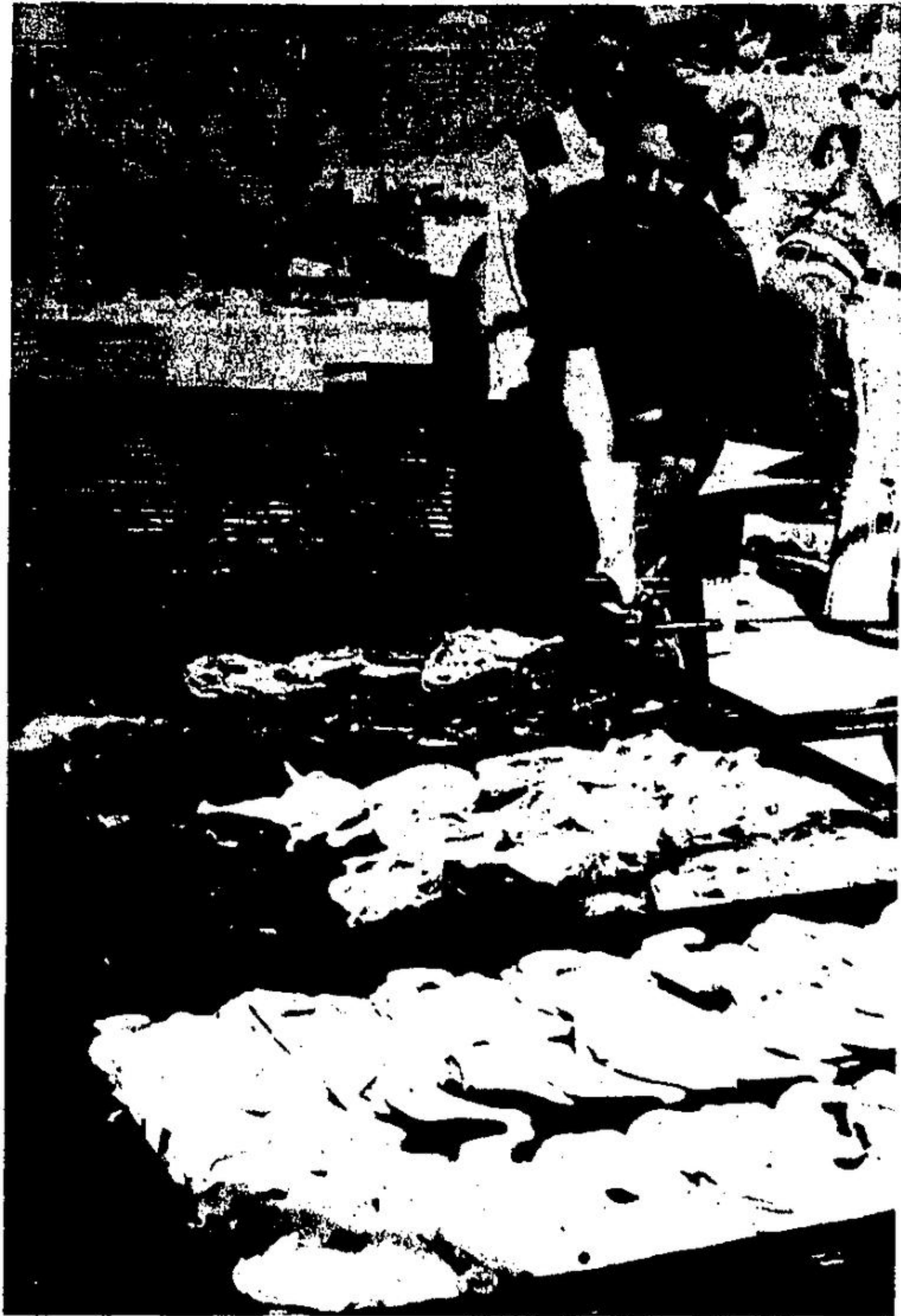
ACTON LIONS Club chicken barbecue was a popular eating booth at the Fall Fair.