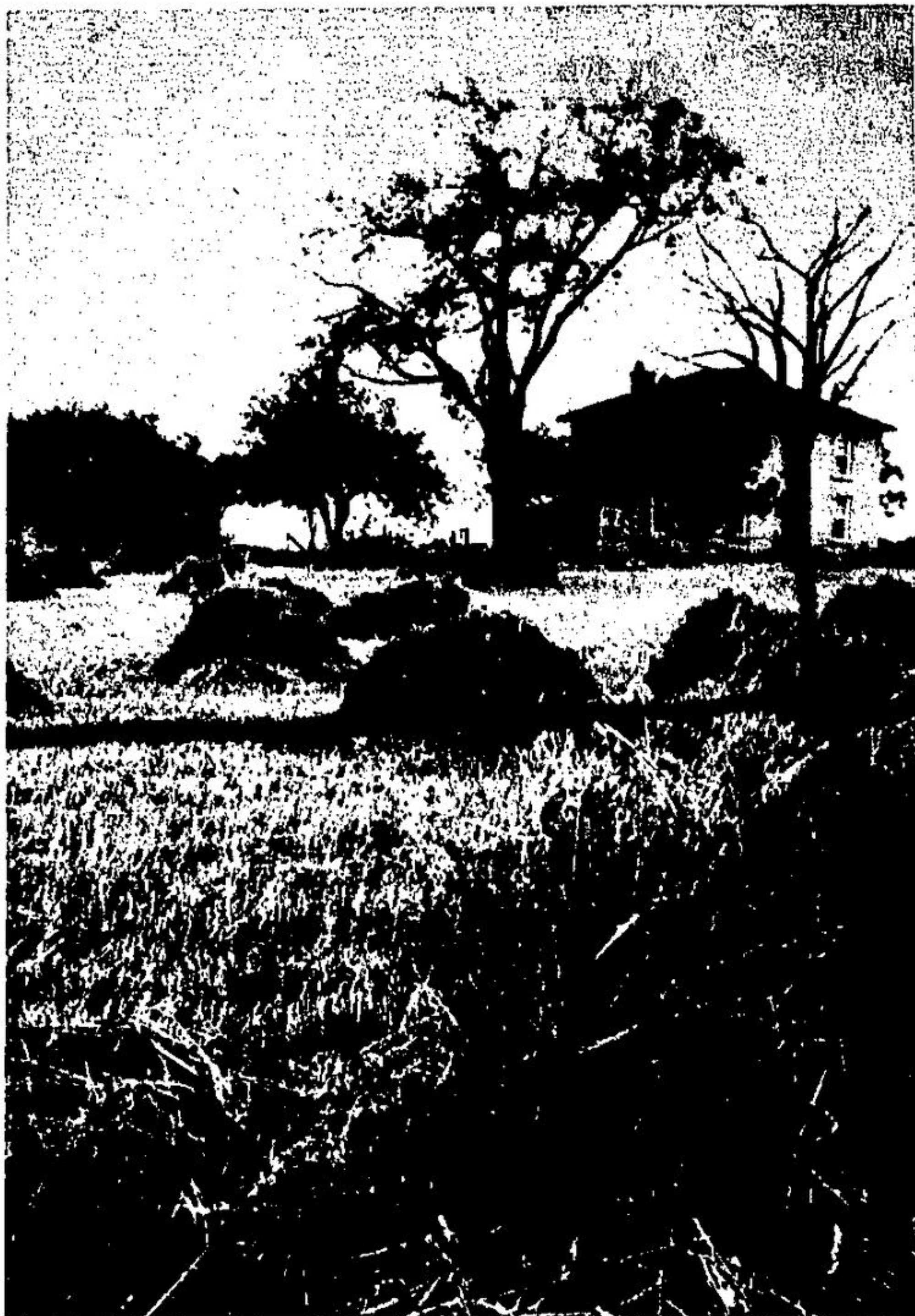
BRINGING IN THE SHEAVES is almost as old-fashioned as stump fences in this age of giant combines but a few district farmers still "stook" their grain such as these along Highway 24, west of Rockwood. The stooks are a reminder that the harvest season is here and summer is fading.

Trustees have also instructed secretary L. P. Hockey to write the Ministry of the Environment to ask for a copy of an air photo of the village with the proposed water and sewer lines superimposed, a map they were promised last month. They are also asking for guidance on the rates that will be charged.