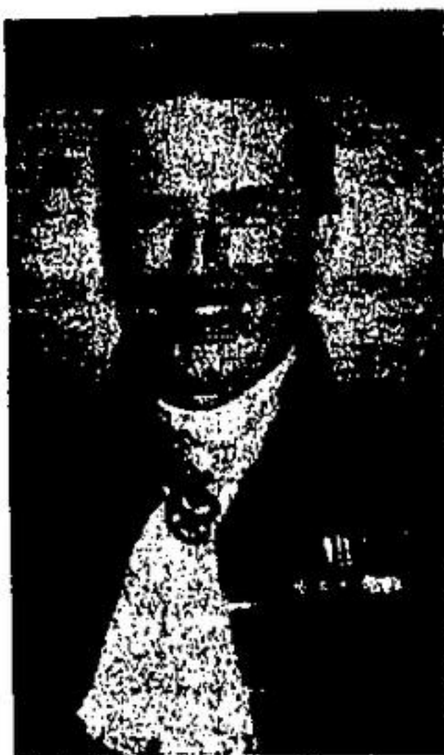
DUKE OF ARGYLL