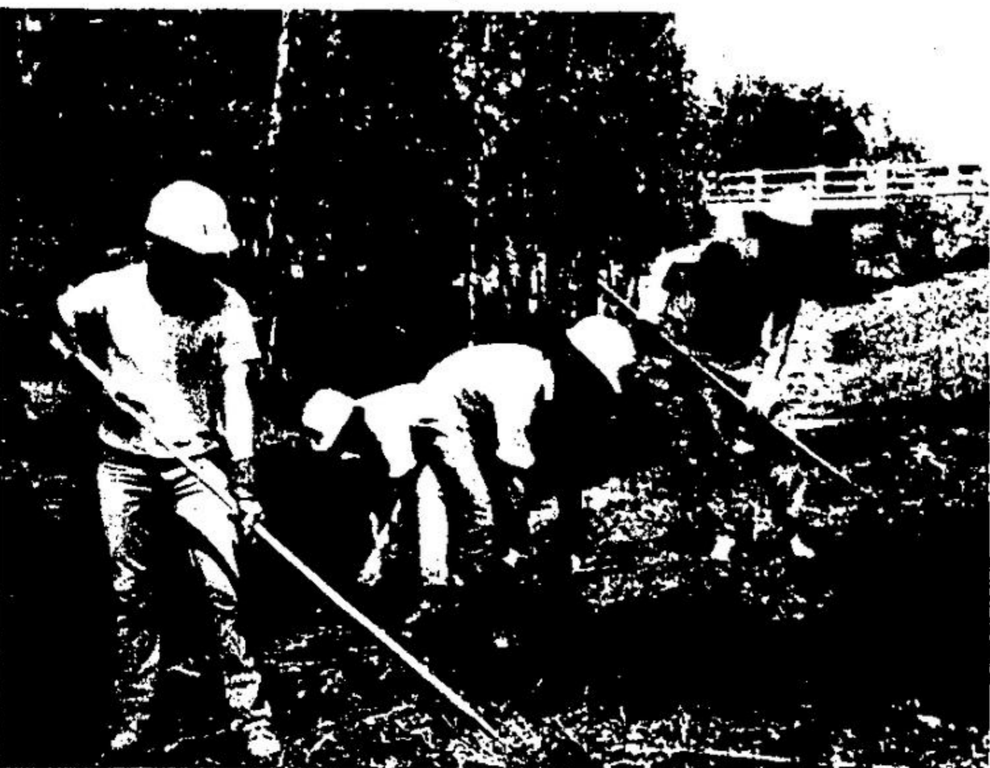
SWEEP CREW cleans up the river banks at Eden Mills.

On Wednesday, July 5, the Halton 4-H Agricultural Club members travelled to the Ontario Science Centre, Toronto, for their annual bus trip. This trip is sponsored by the Kiwanis Club of the Kingsway in Toronto. At noon refreshments were provided by the Kiwanians.