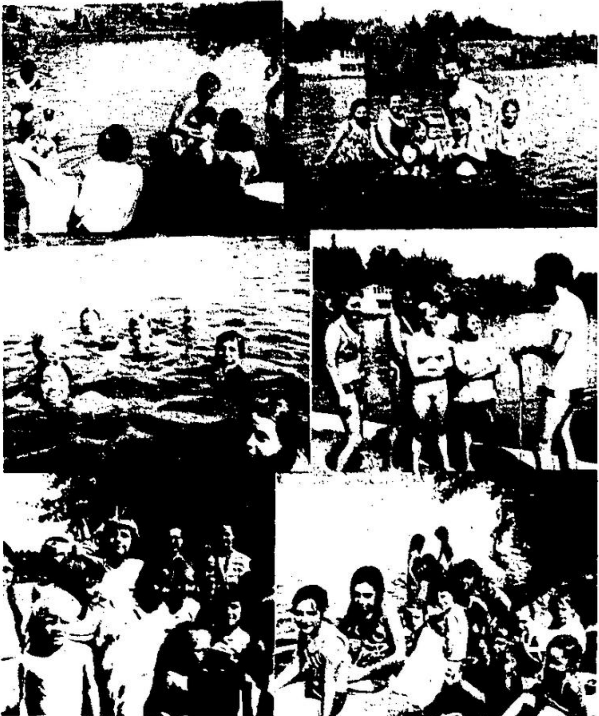
ALL SHAPES AND SIZES ARE OUT for swimming lessons at Eden Mills' picturesque millpond. The lessons are popular attractions for residents of the village and district.