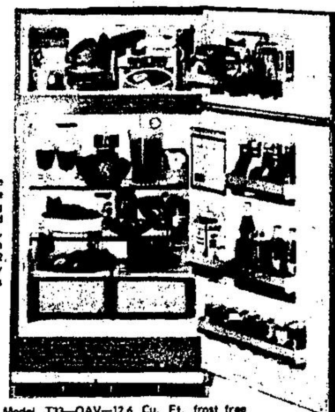
Model T33-OAV—12.6 Cu. Ft. frost free