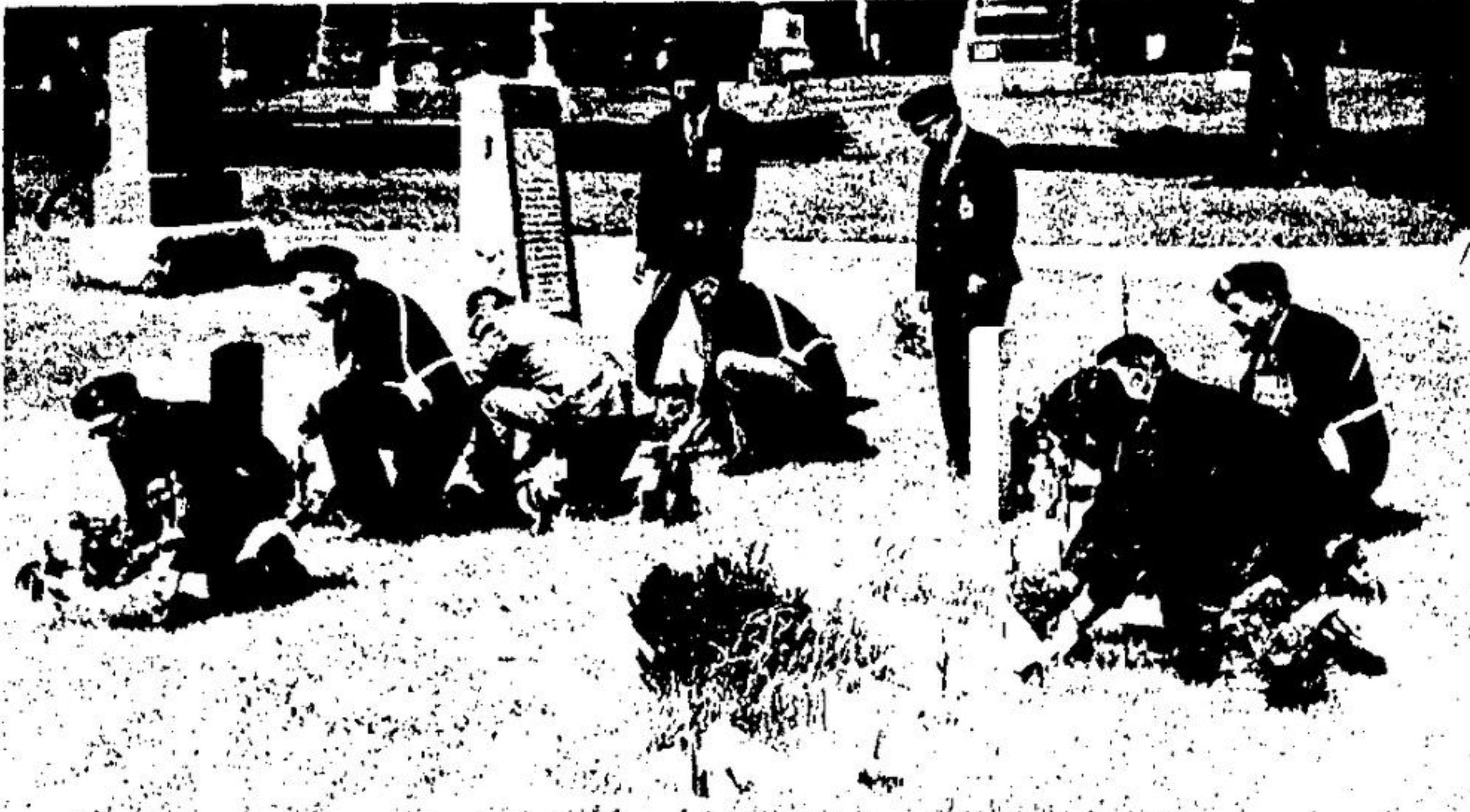
SYMBOLIC POPPIES as well as the usual scarlet geraniums are placed on the Legion plot at Fairview cemetery Sunday afternoon by Legion members. The town's World War I monument is surrounded by smaller stones in