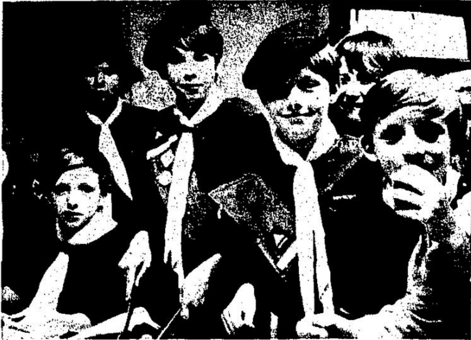
CUBS AND SCOUTS lined up to partake of the delicious repast provided by the mothers and committee leaders for the first Cub, Scout, and Brownie banquet held at which mothers and fathers were both invited to attend.