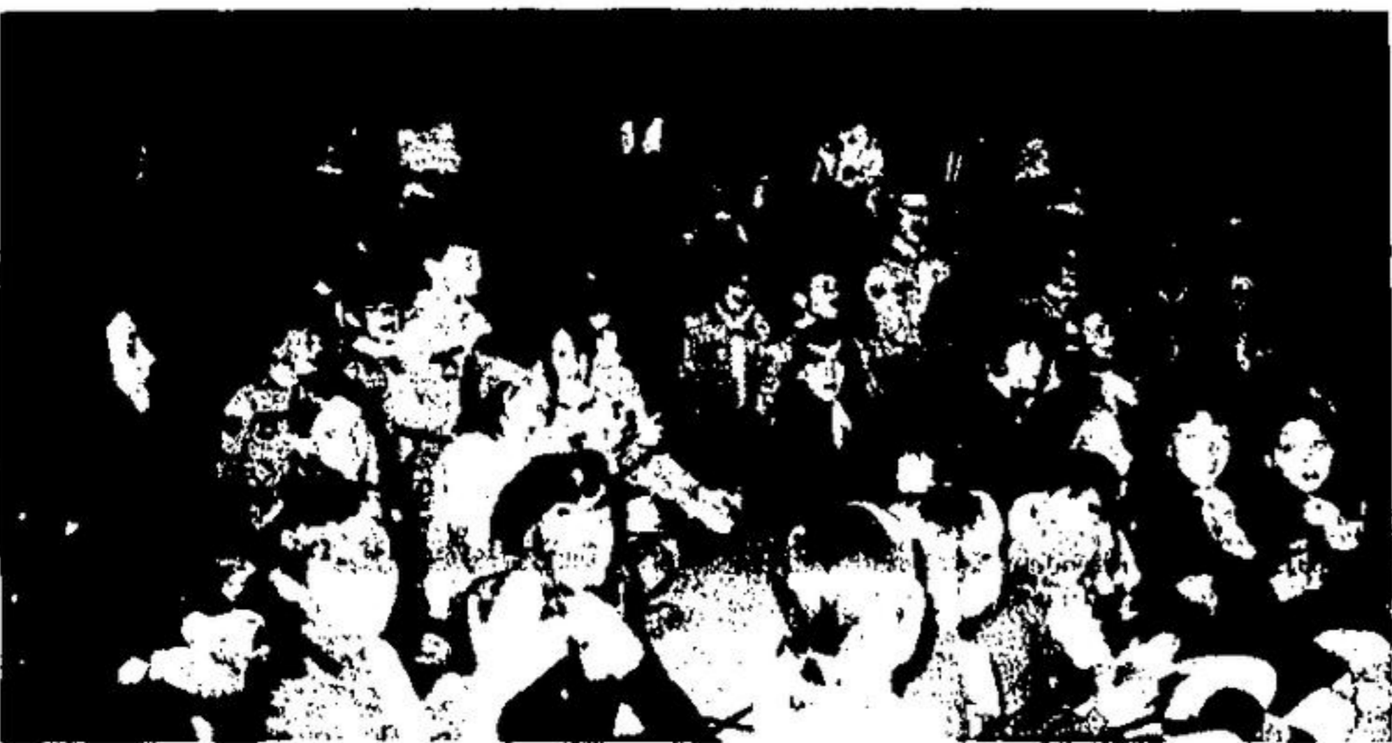
OVER 60 CHILDREN participated in last tremendous success by the group Tuesday's banquet which was rated a committee.