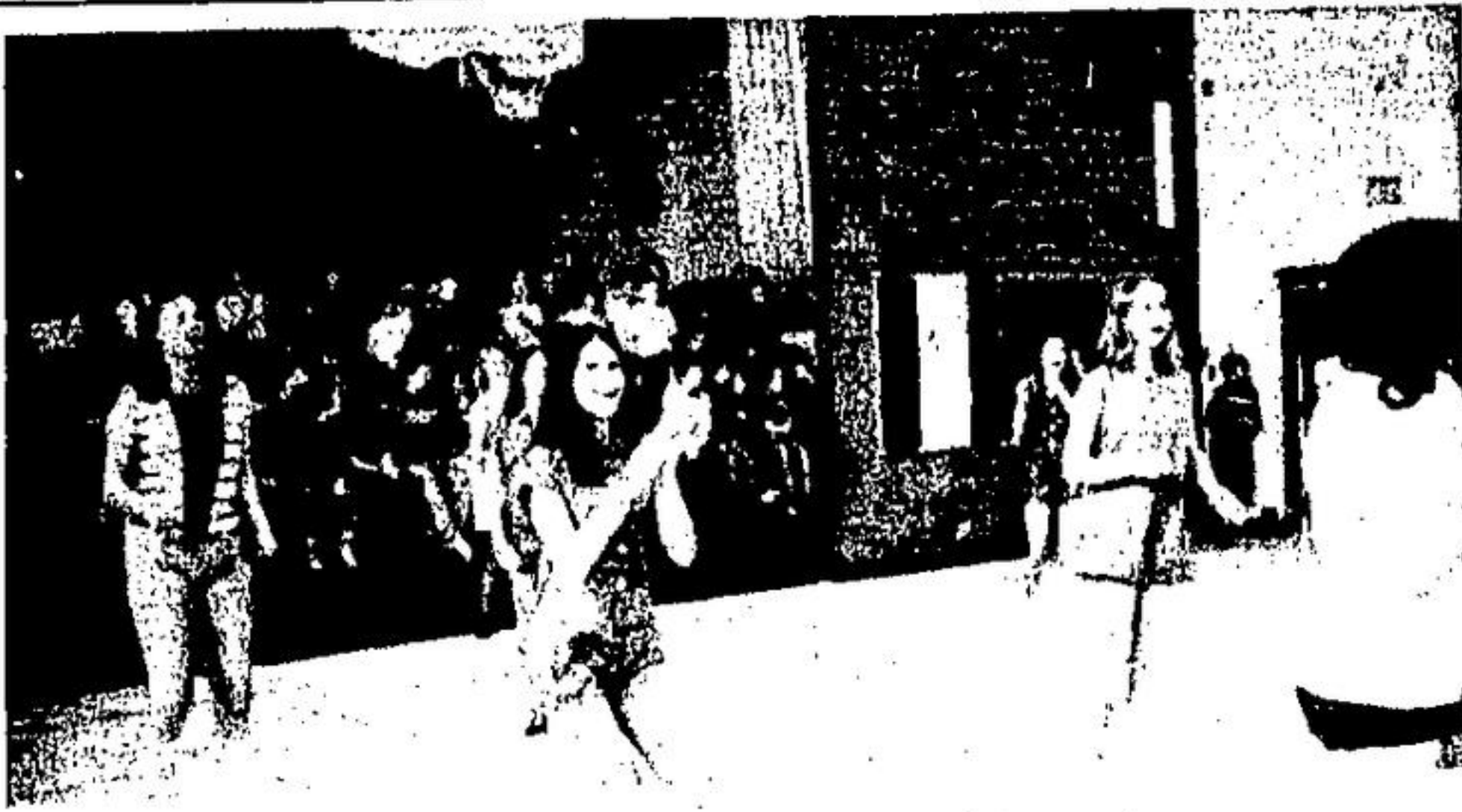
Rockwood volleyballers score a point.