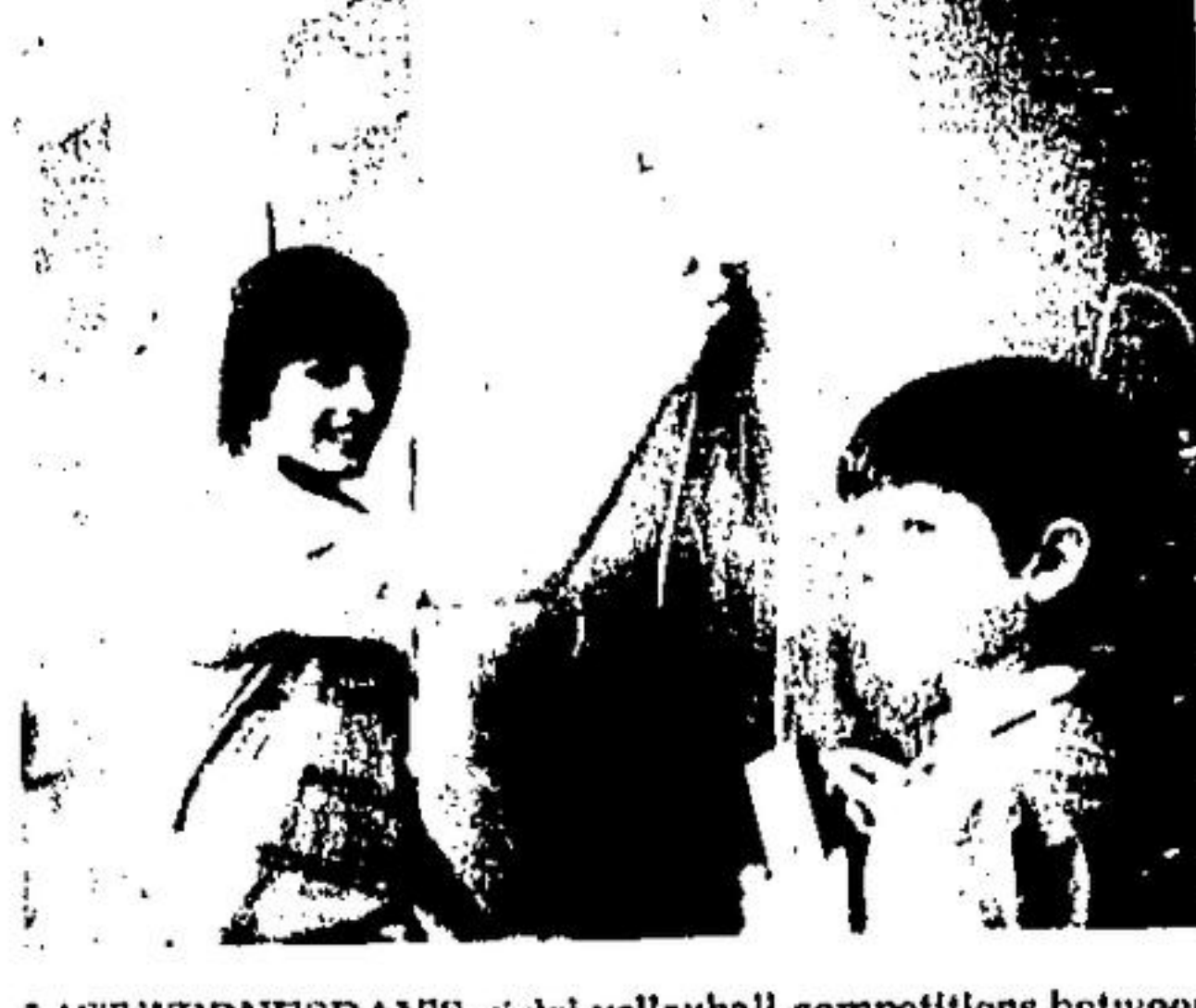
LAST WEDNESDAY'S girls' volleyball competitions between the Rockwood and Eramosa girls showed tough opposition with an energetic noon hour crowd of rooters from the local team. The final score reading 45 to 32 for the Centennial athletes is chalked up by two Rockwood boys who also star in the local boys' activities.