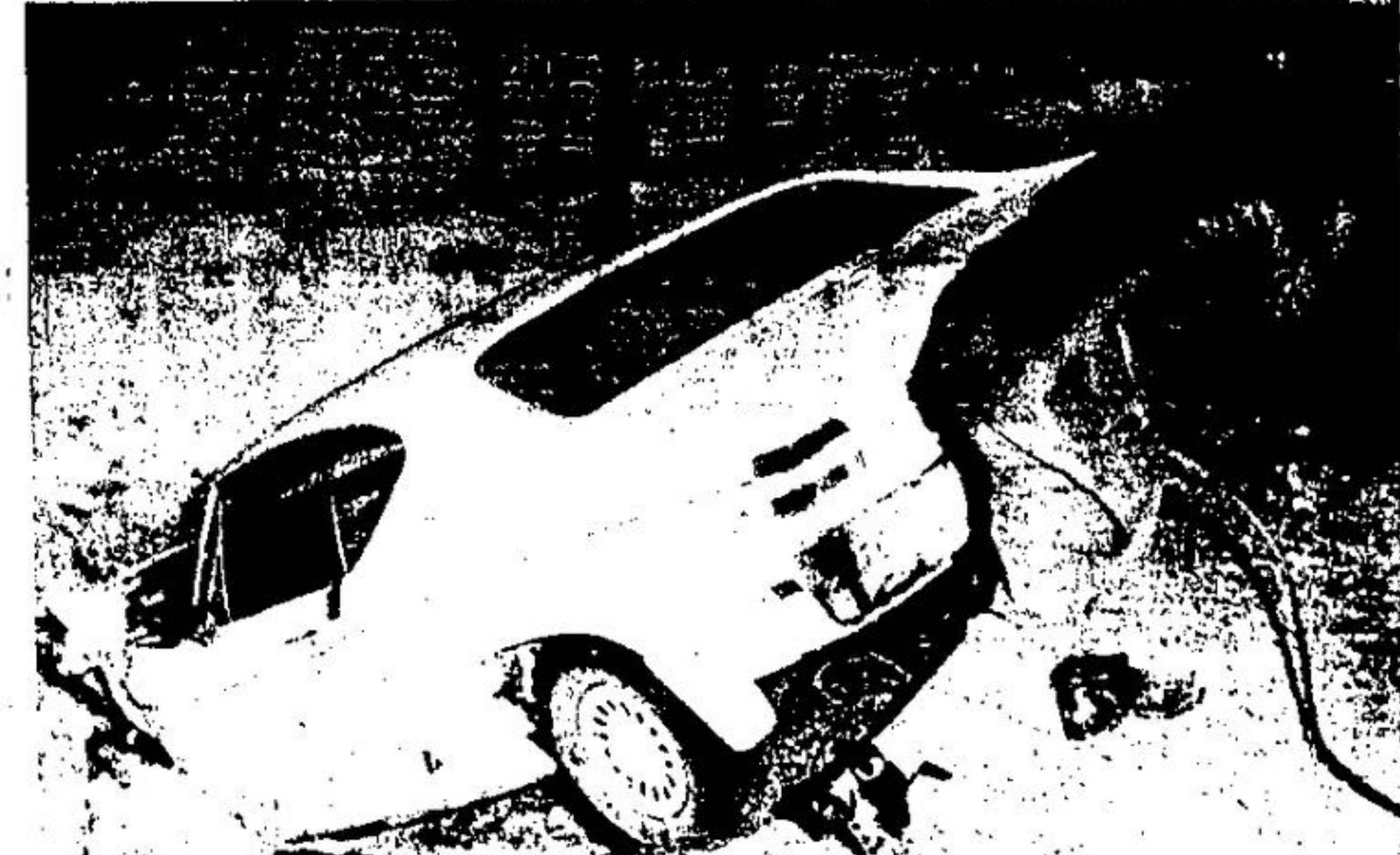
ONE OF TWO CARS involved in a crash near Toth Motors. Ten people were injured in the Crewsons Corners Sunday is towed away by crash.