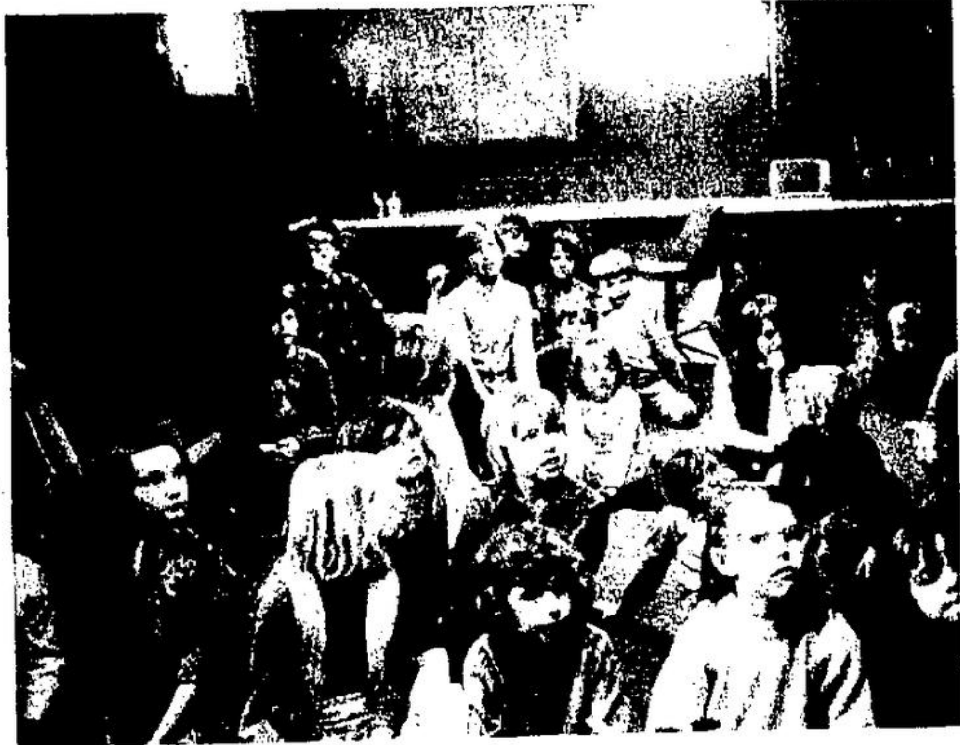
ANXIOUSLY wanting to answer bible questions members of the Children's Bible Club raise their hands for attention.