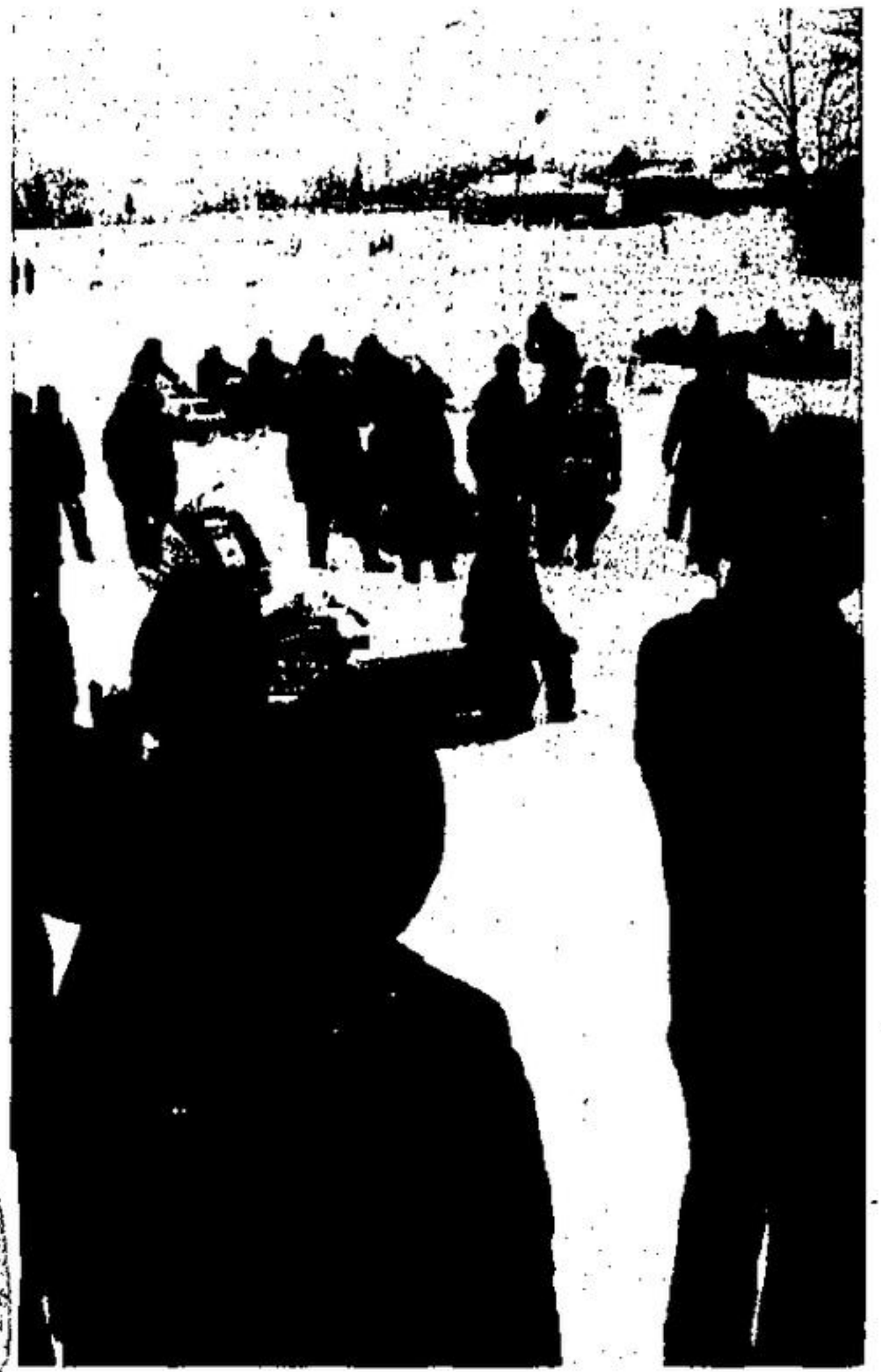
INTENSE INTEREST is shown in this start at the Y's Men's snowmobile races Sunday. There was keen competition among 40 entries.