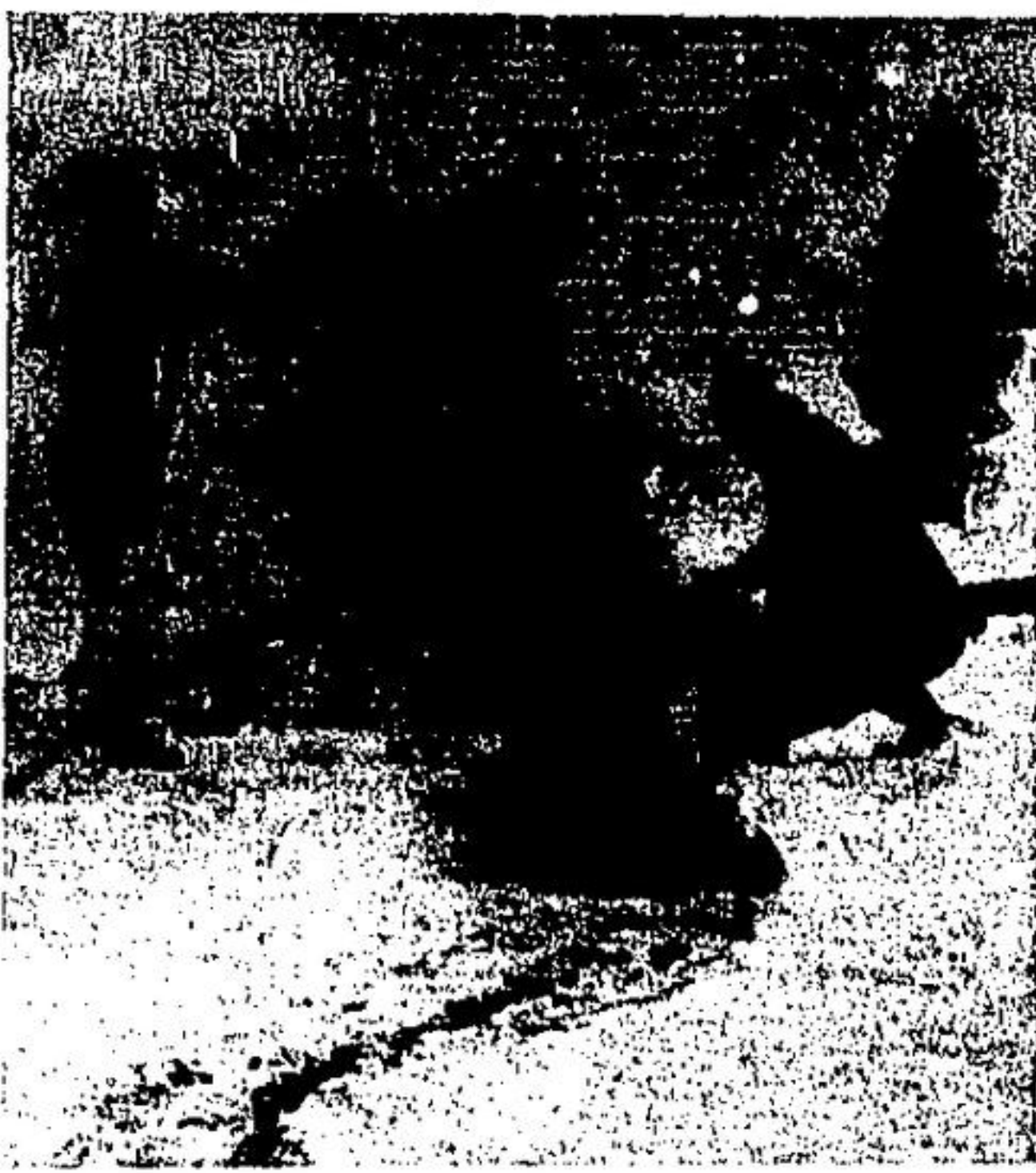
NEIGHBORS HELP firefighters drag burning tires from the burning workshop and garage at R.R. 2, Acton, Saturday.