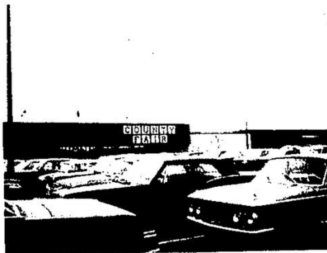
The parking lot at Zeller's County Fair

The parking lot at Zellers County Fair in Georgetown was jammed before 9:00 a.m. on Boxing Day Monday as Georgetown and district shoppers took advantage of the holiday shopping at Zellers.