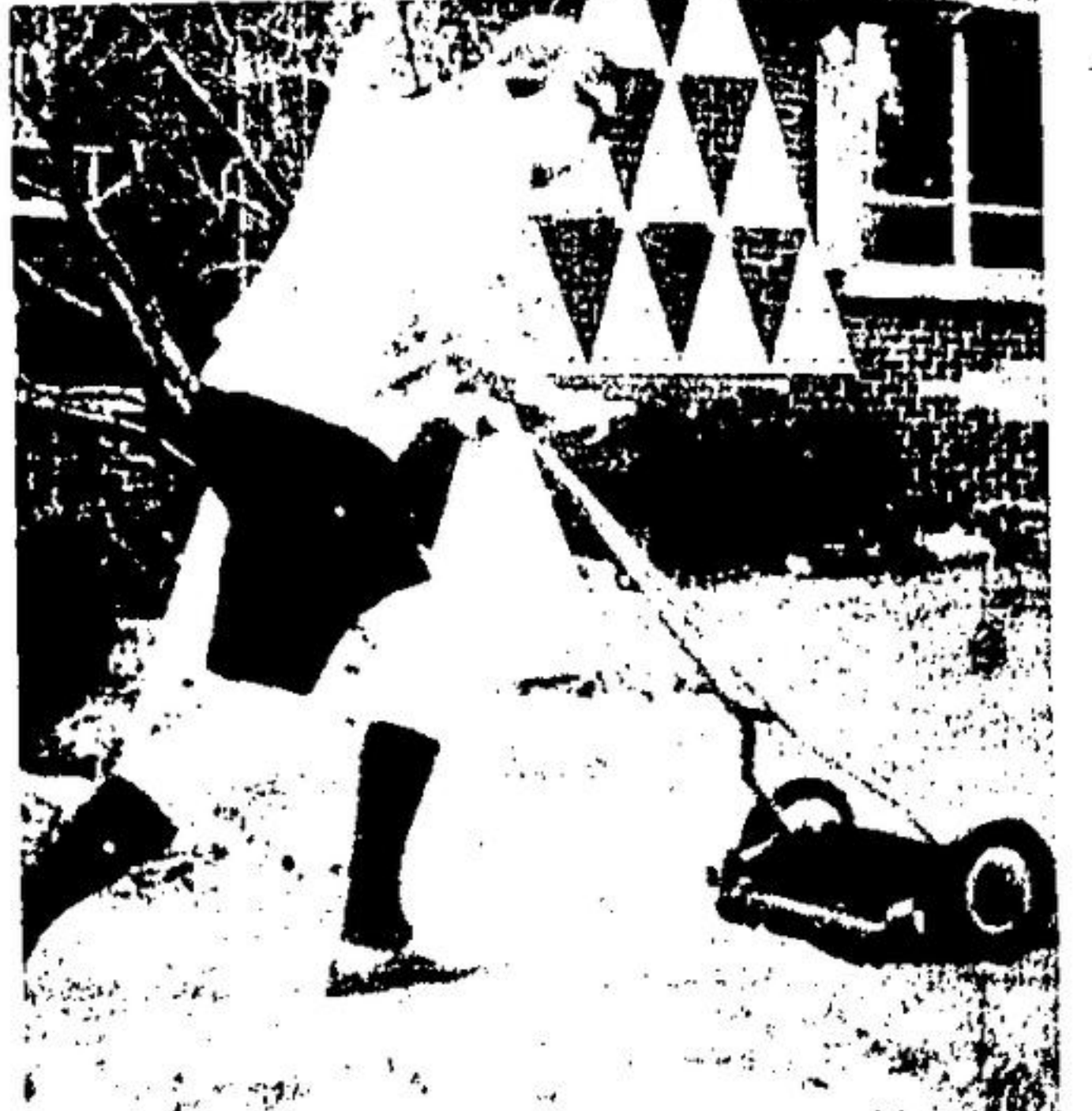
WHAT'S GOING ON HERE? Turn to the editorial page and find out.