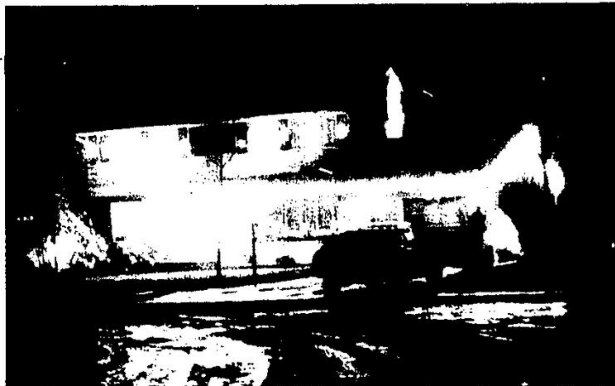
Prize winning Braida home on Longfield Rd.