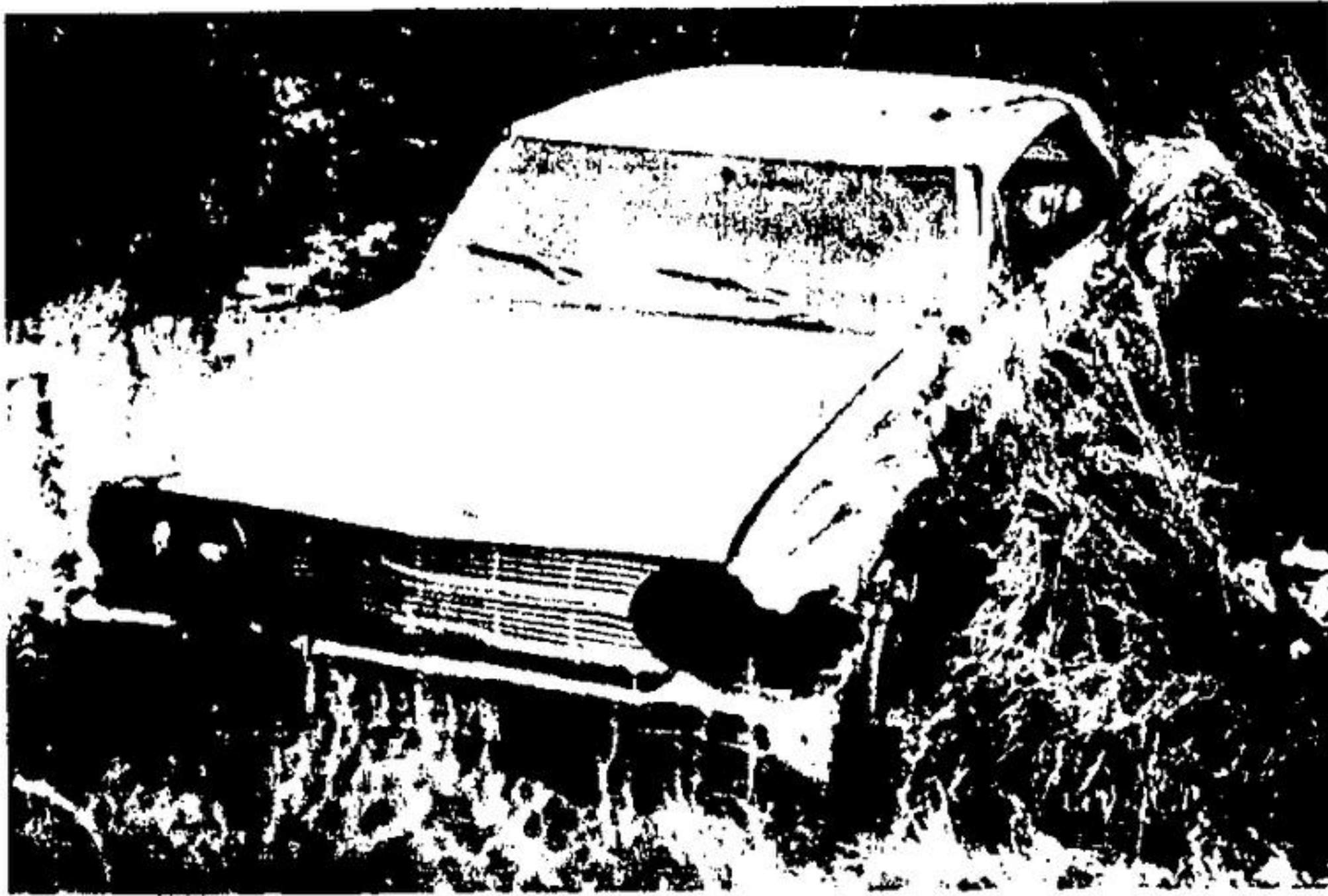
SEVEN PEOPLE WERE IN THIS car when it plunged over an embankment after a collision at Crewson's Corners Christmas eve and came to rest in a swamp. Police report only minor injuries from the crash which occurred about 5 p.m. Friday.