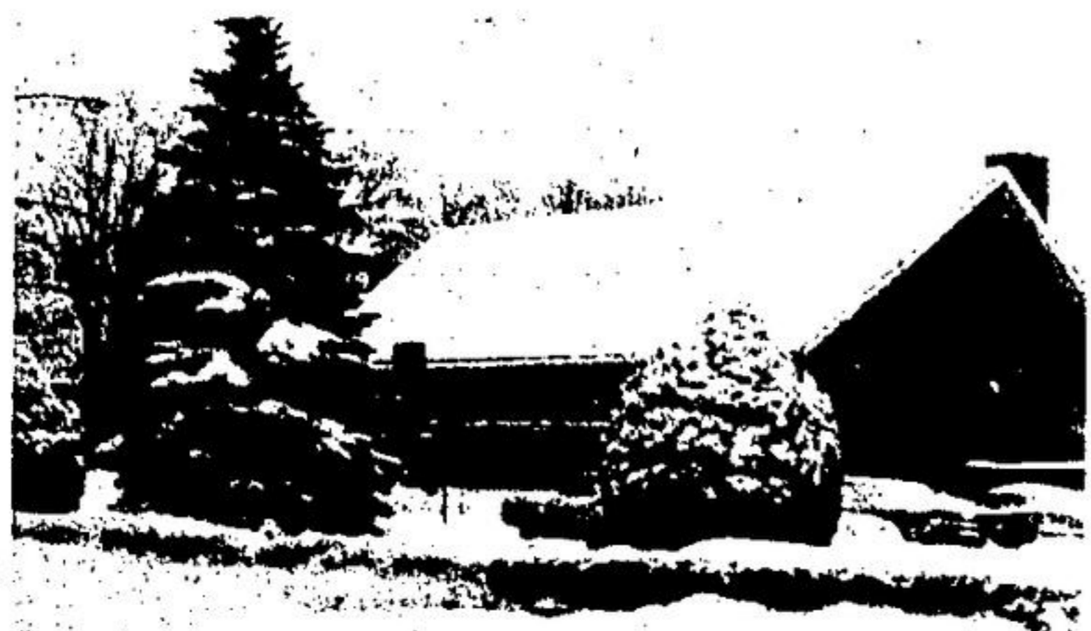
The flakes were lovely and thick