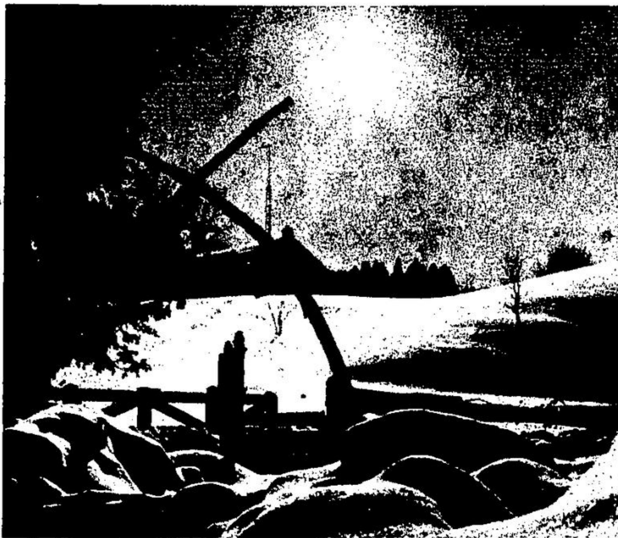
The sun broke out like Bethlehem's Star