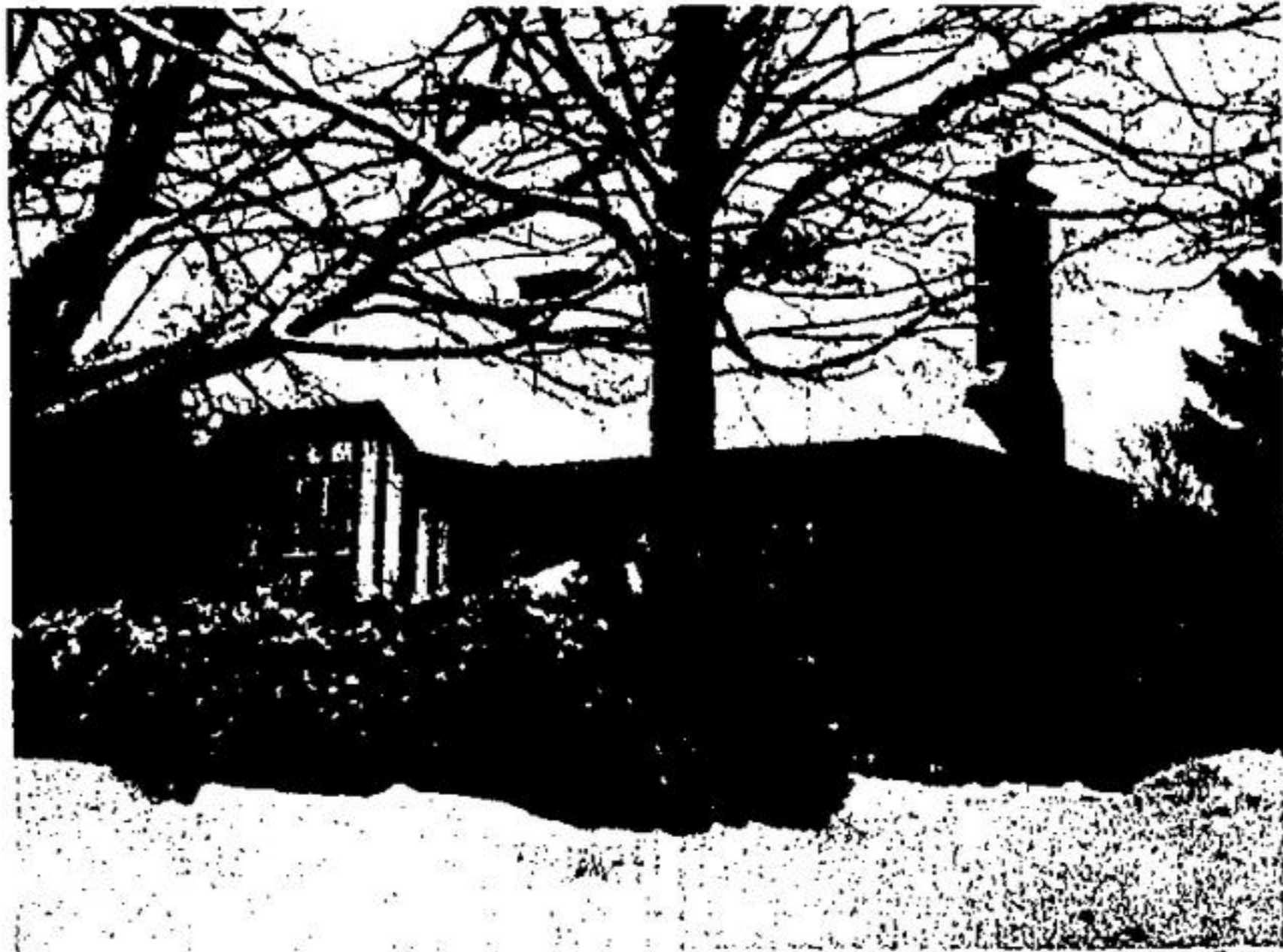
The cedars at York House bowed under the snow