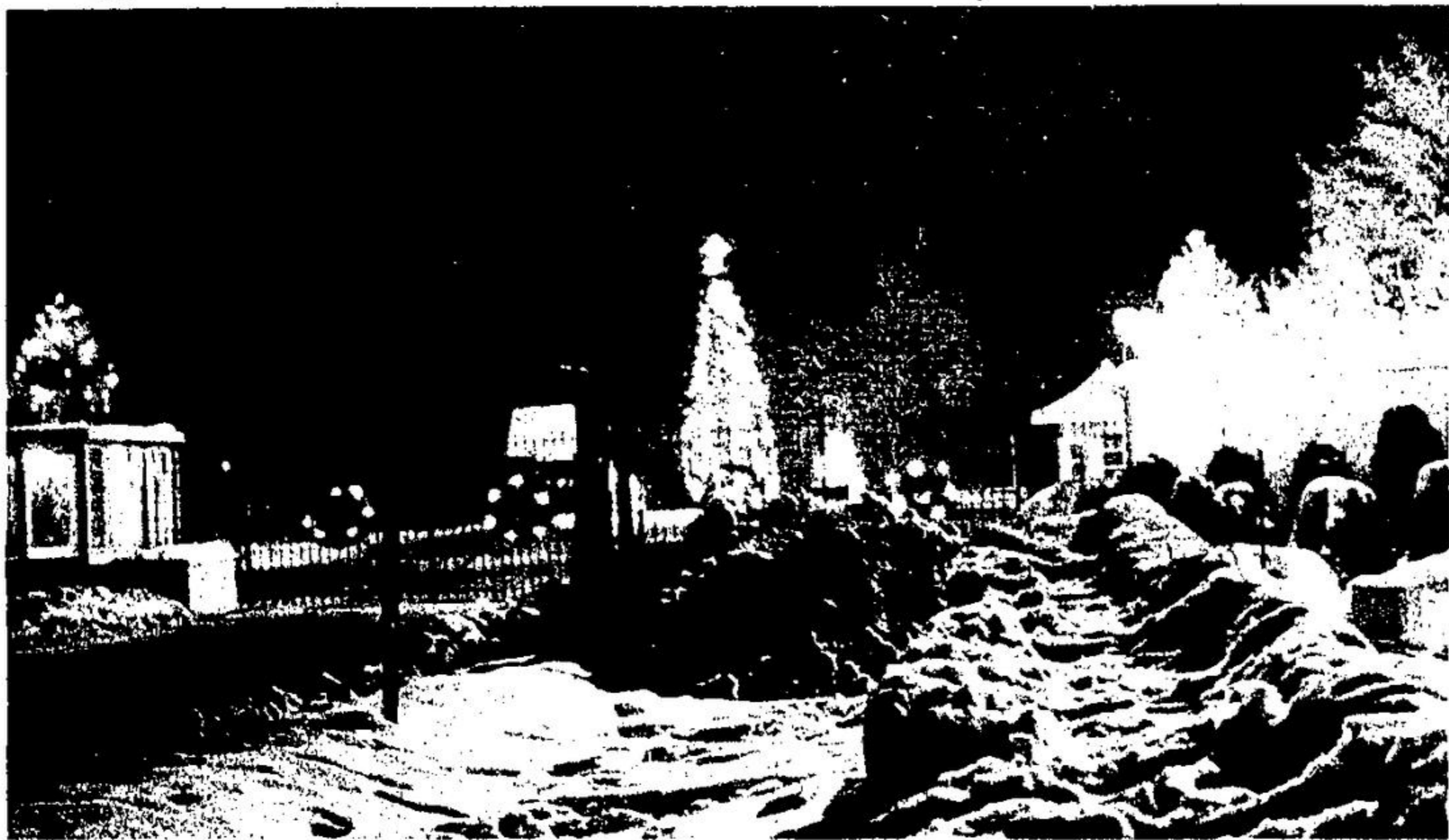
One of the best sights in town—the Beardmore gates on Elgin St.