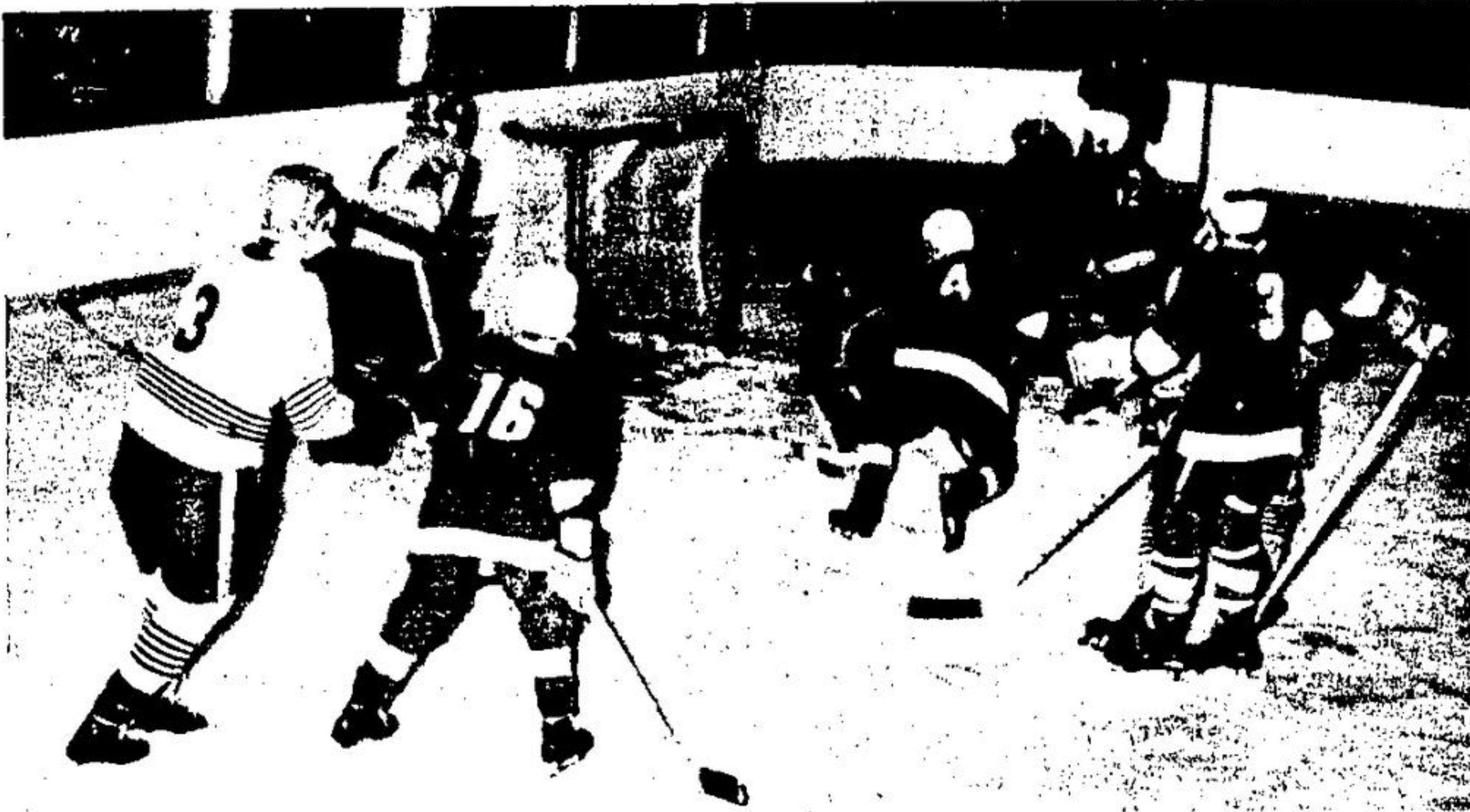
ACTION AROUND net was tense in a game between Acton Firefighters Bantams here Saturday. Acton won 6-3, the only win in three games with the visitors.

To prevent forest fire, never smoke while walking or working in the woods. Sit down to smoke. Douse butts and matches in water or rub them out between the fingers.