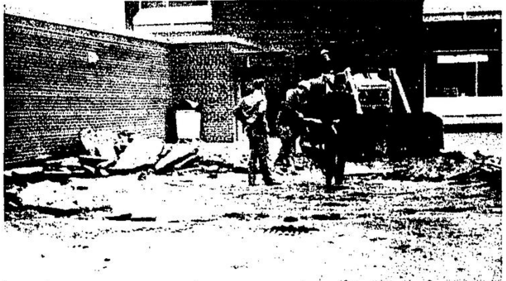
CLEARING THE way for ways to better learning, this bulldozer began ripping up asphalt at the south end of Acton District High last Thursday, on the site where the school's new resource centre is to be constructed.