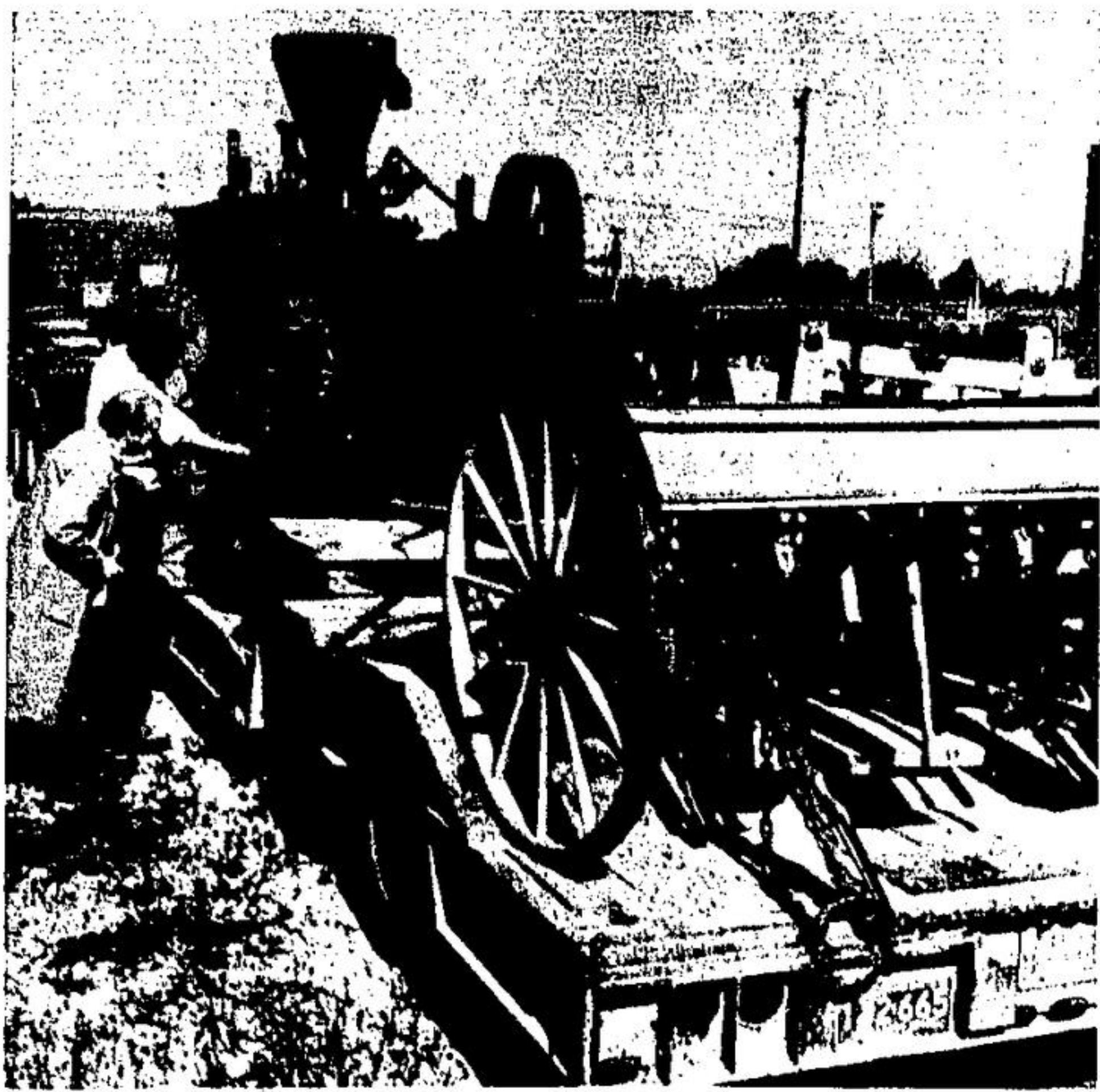
CUSTOMS BROKER looks over an unusual load of antique farm equipment at the Goy Cartage yard last Friday. Each load weighed about 10 tons. The articles came from a collector in Michigan and were headed for the provincial museum at Hawkestone.