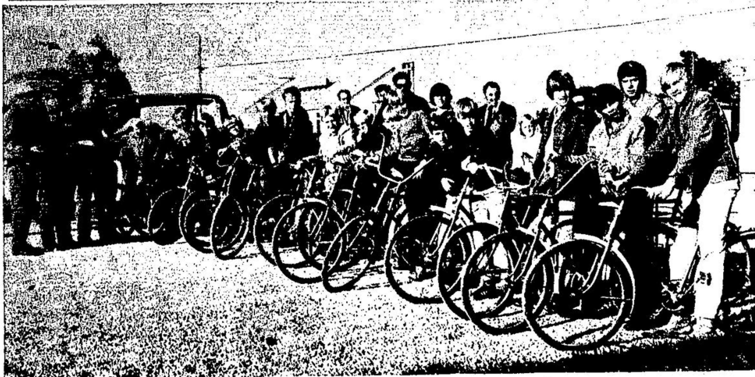
MEMBERS OF THE CALVINIST Cadet Corps line up prior to the start of their 40 mile bicycle hike Saturday. With $9.50 riding on every mile riders challenged 7 Highway and roads in Esquesing and Nassagaweya to complete the 40 mile course,