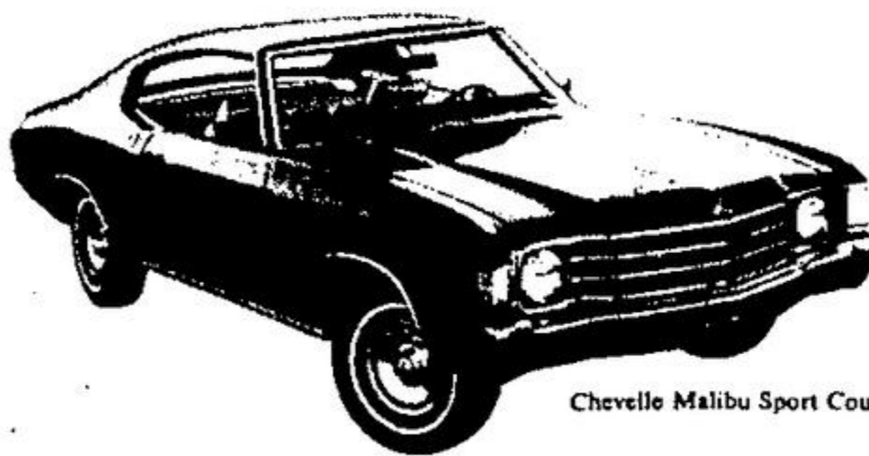
Chevelle Malibu Sport Coupe.