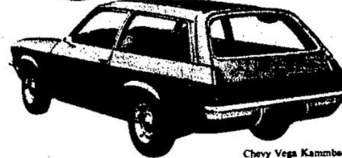
Chevy Vega Kammback Wagon.

See your Chevrolet/Oldsmobile dealer today.