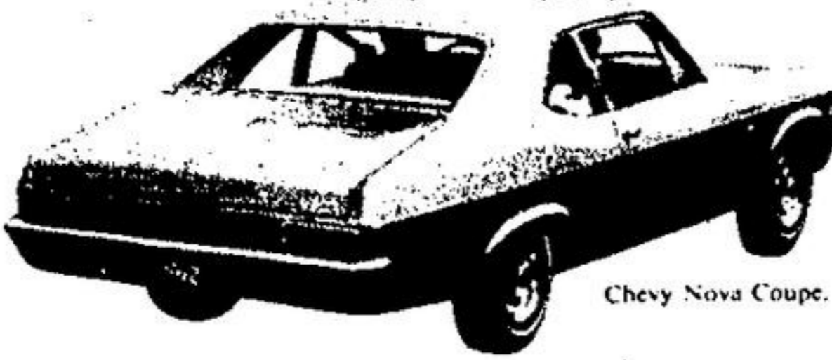
Chevy Nova Coupe.