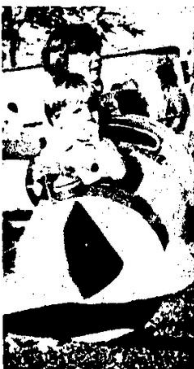
SPACE adventurers try out a UFO. —(Staff Photo)