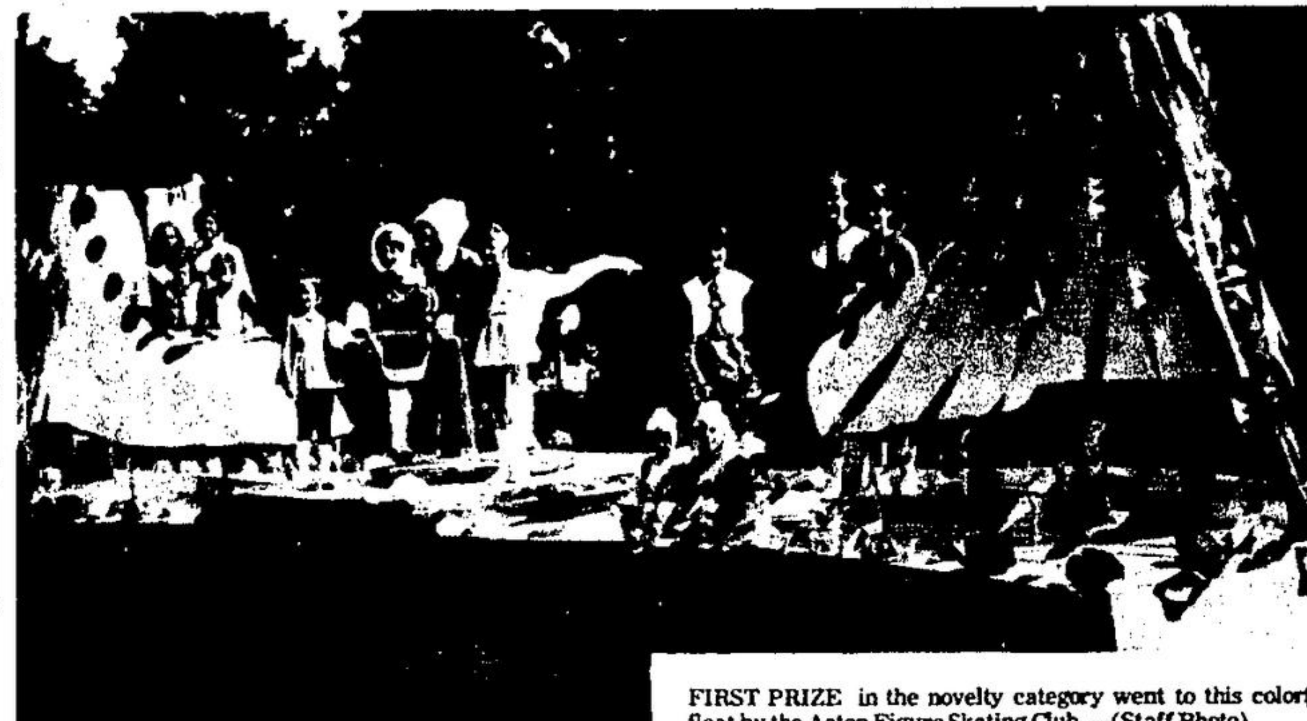
FIRST PRIZE in the novelty category went to this colorful float by the Acton Figure Skating Club.