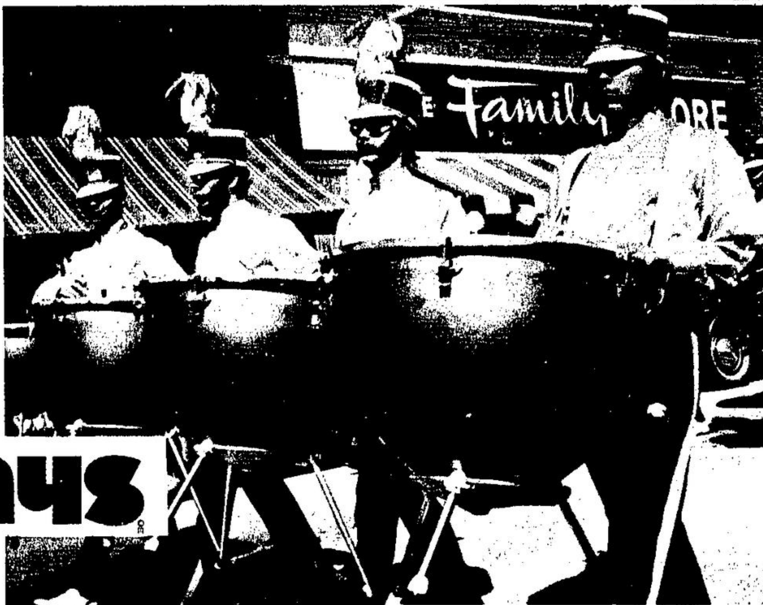
TYMPANI PLAYERS of the Guelph Opti-Knights drum and bugle corps marched in unison.