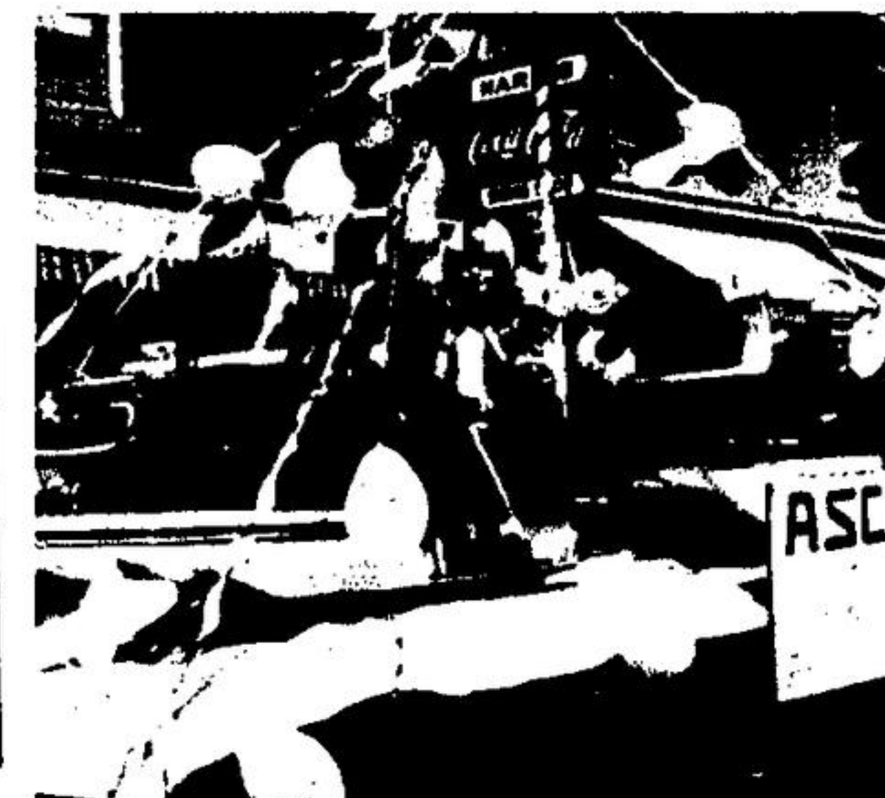
ACTON SNOWMOBILE CLUB members were dressed warmly for the parade.