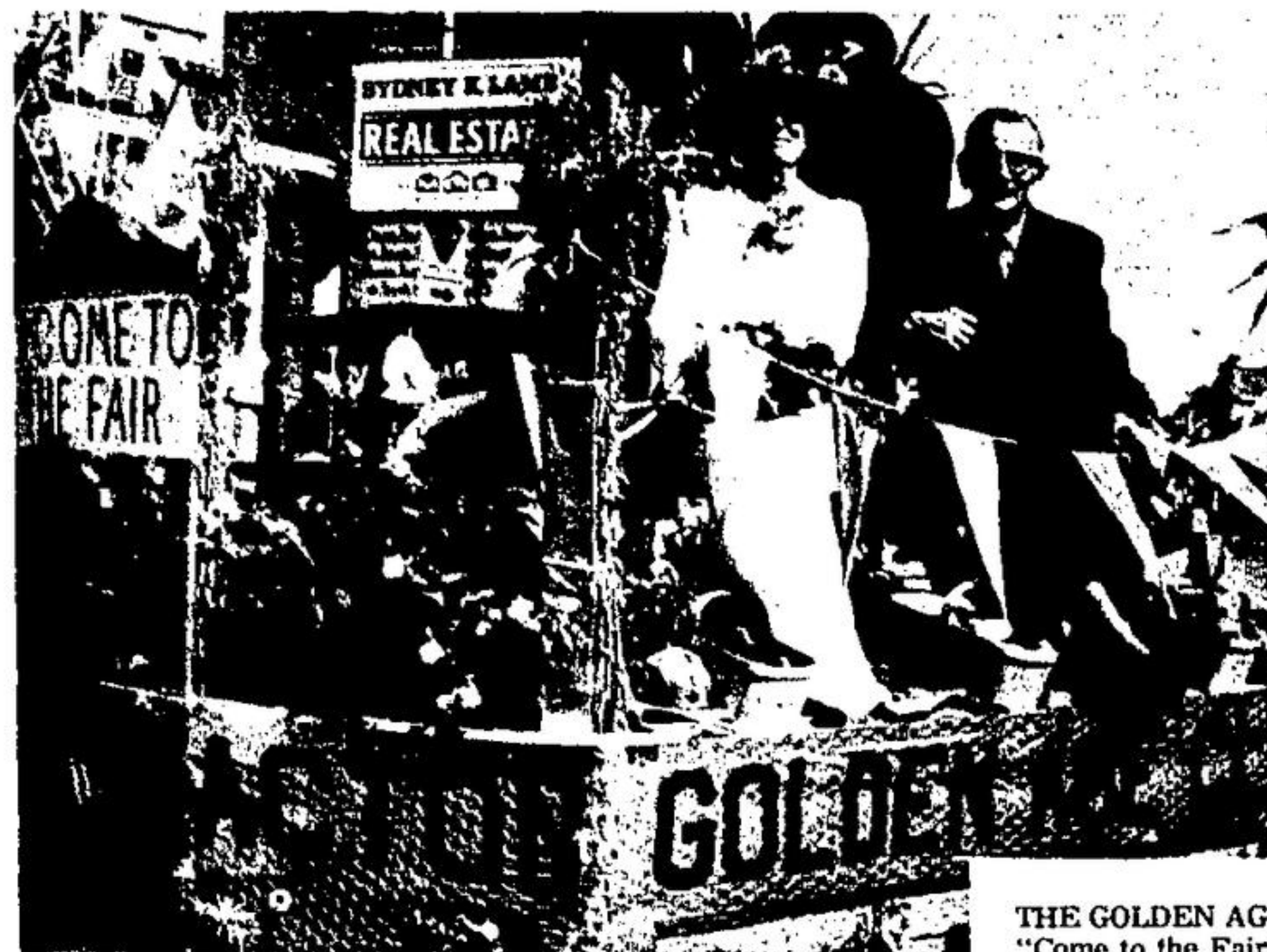
THE GOLDEN AGE float invited visitors to "Come to the Fair".