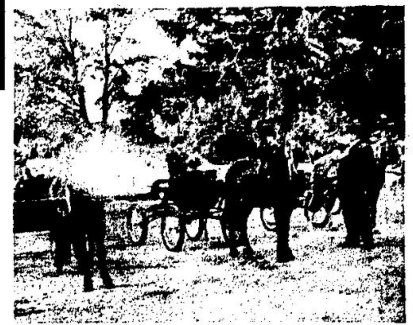
JIMMY PICKENS of Durham was judge for the Fall Fair pony show.