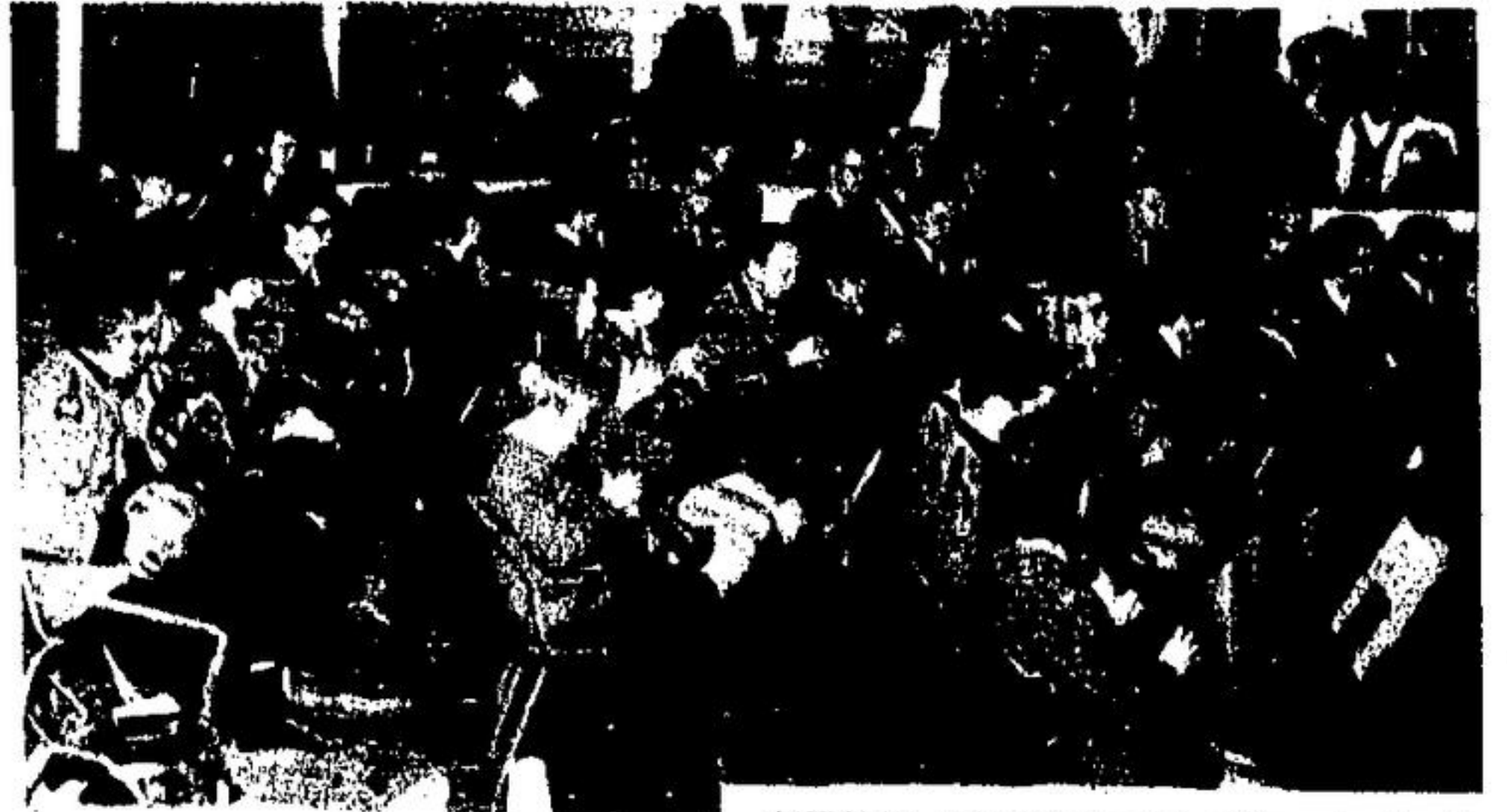
ACTON'S PRIZE-winning Citizens' Band played several selections prior to the variety show. —(Staff Photo)