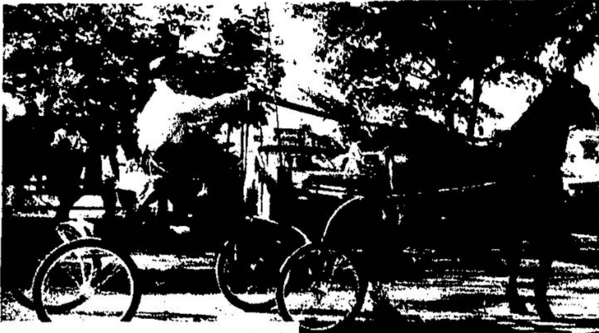
ALF WYNTER, R.R. 2 Acton, placed first in the 15.2 and under single carriage class.