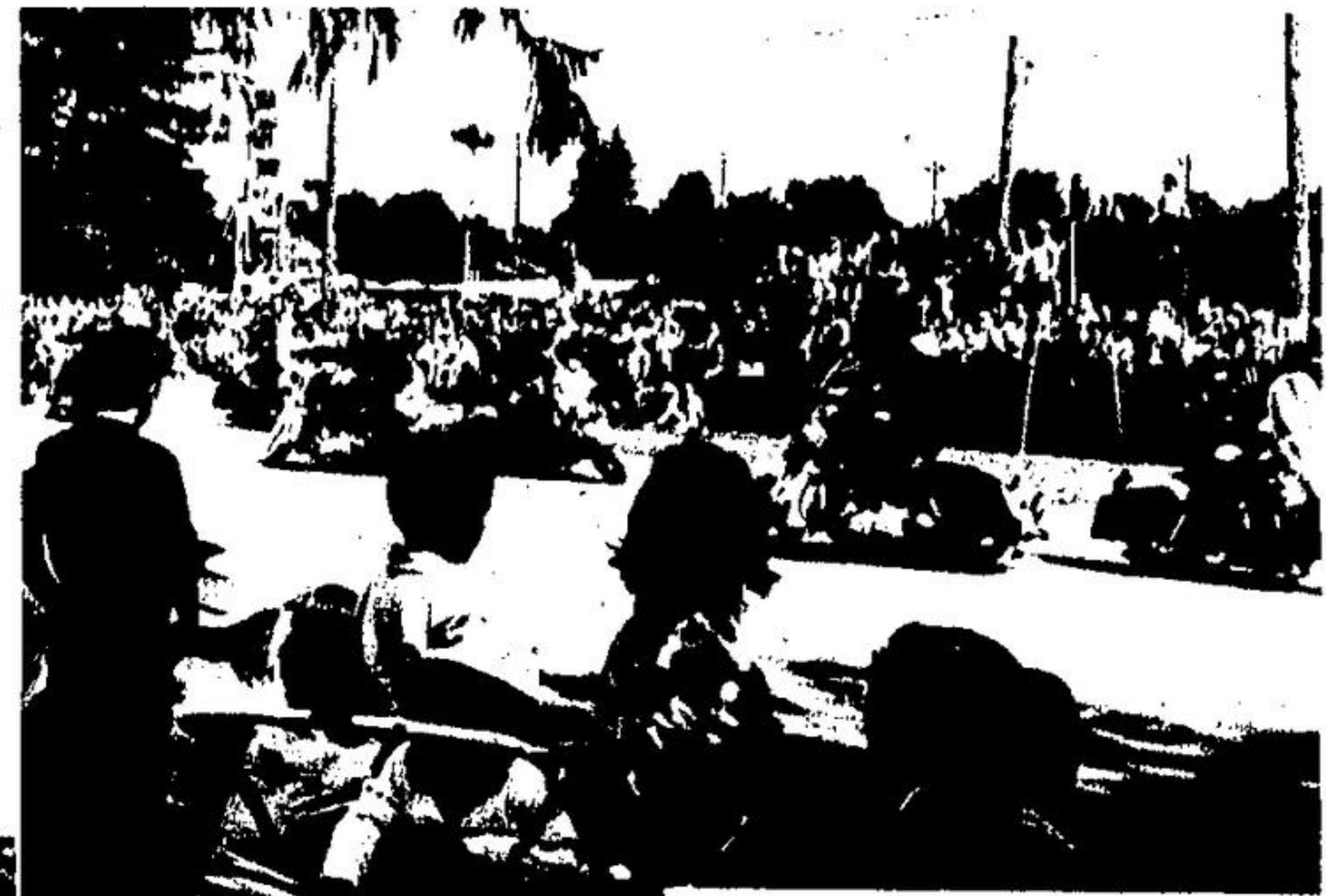
THE O.P.P. Golden Helmets scored a big hit with their precision riding.