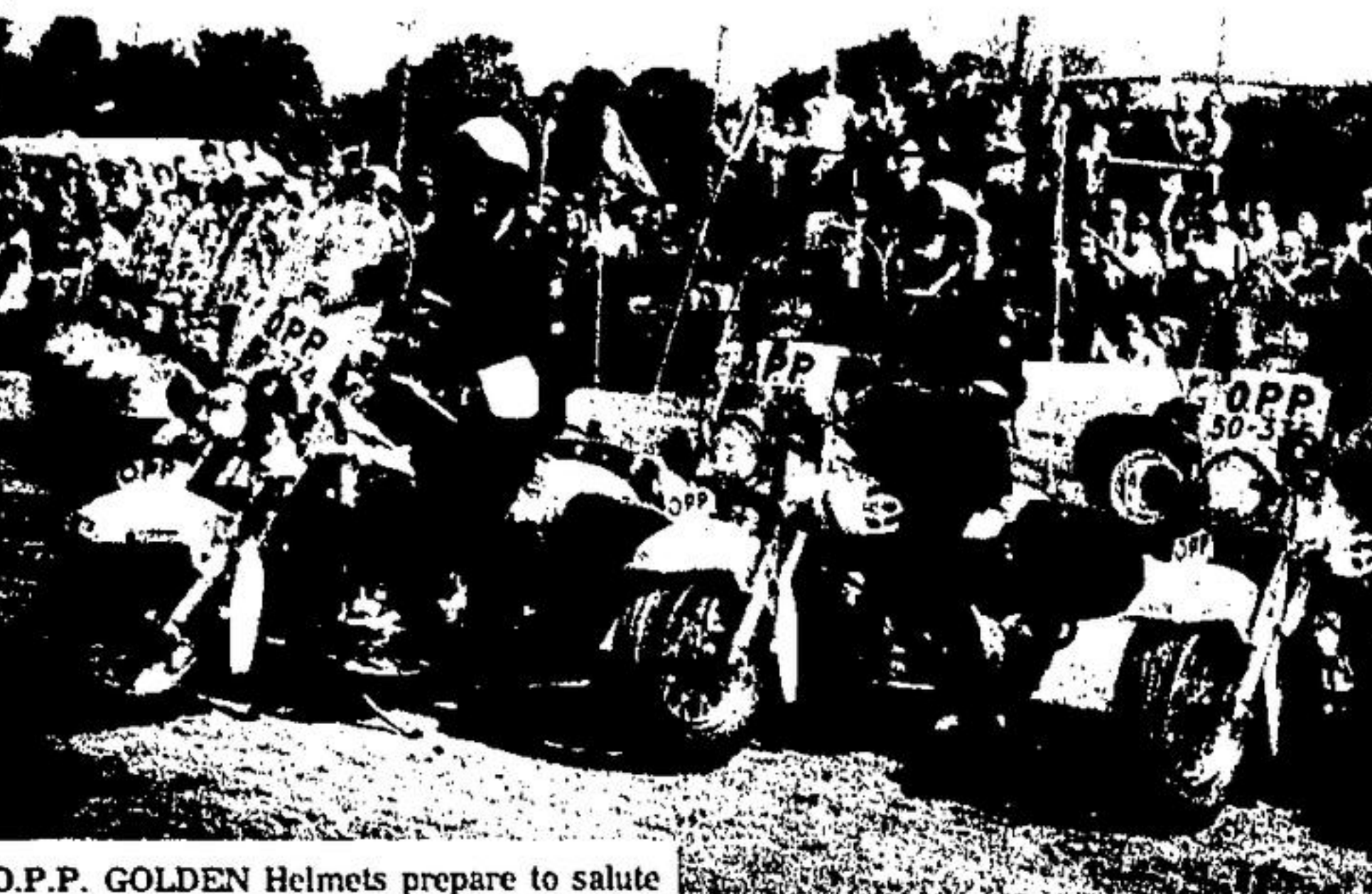
O.P.P. GOLDEN Helmets prepare to salute their superiors prior to their performance Saturday.