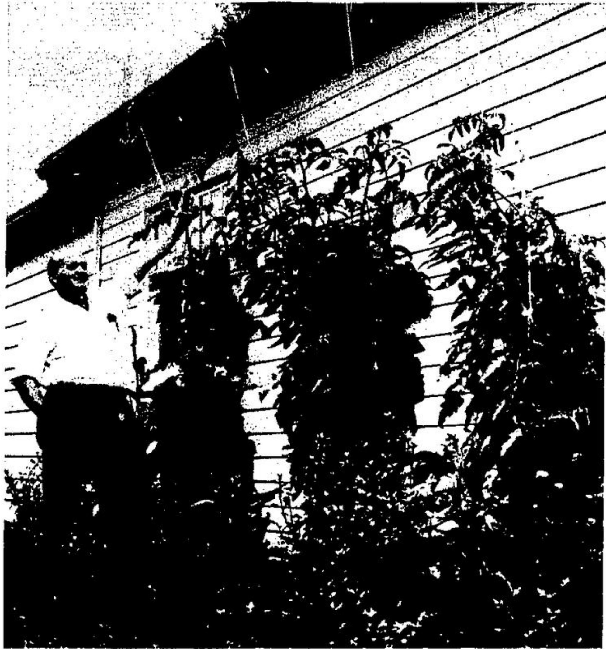
FACED WITH the enviable problem of what to do with his oversized tomato plants, amateur gardener Tom Dawkins, 85 Victoria Street, used a little ingenuity and tied them to the eavestroughs. Tallest of the three plants measures eight feet. They were planted approximately June 1 and Tom reaped his first batch of juicy tomatoes about 10 days ago. All three plants are loaded with tasty treats.