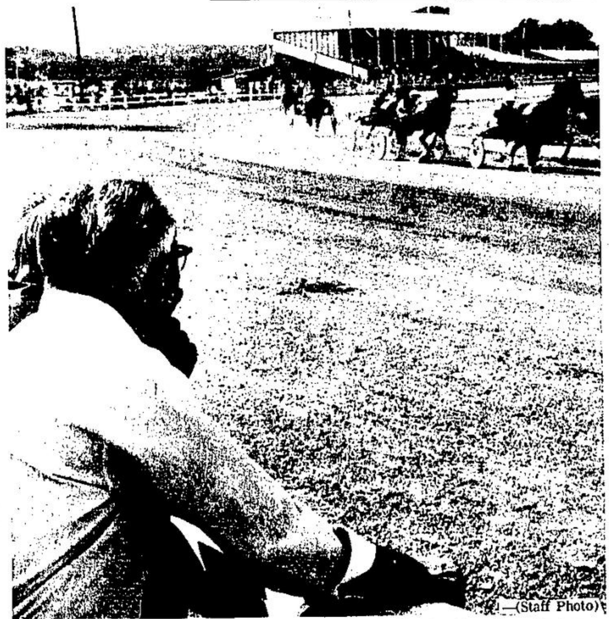
SPECTATORS get a good view of horses rounding the first turn from the paddock area.

Barbers play in Fergus, tomorrow (Thursday) night and face arch-rival Rockwood in a big home and home series next week.