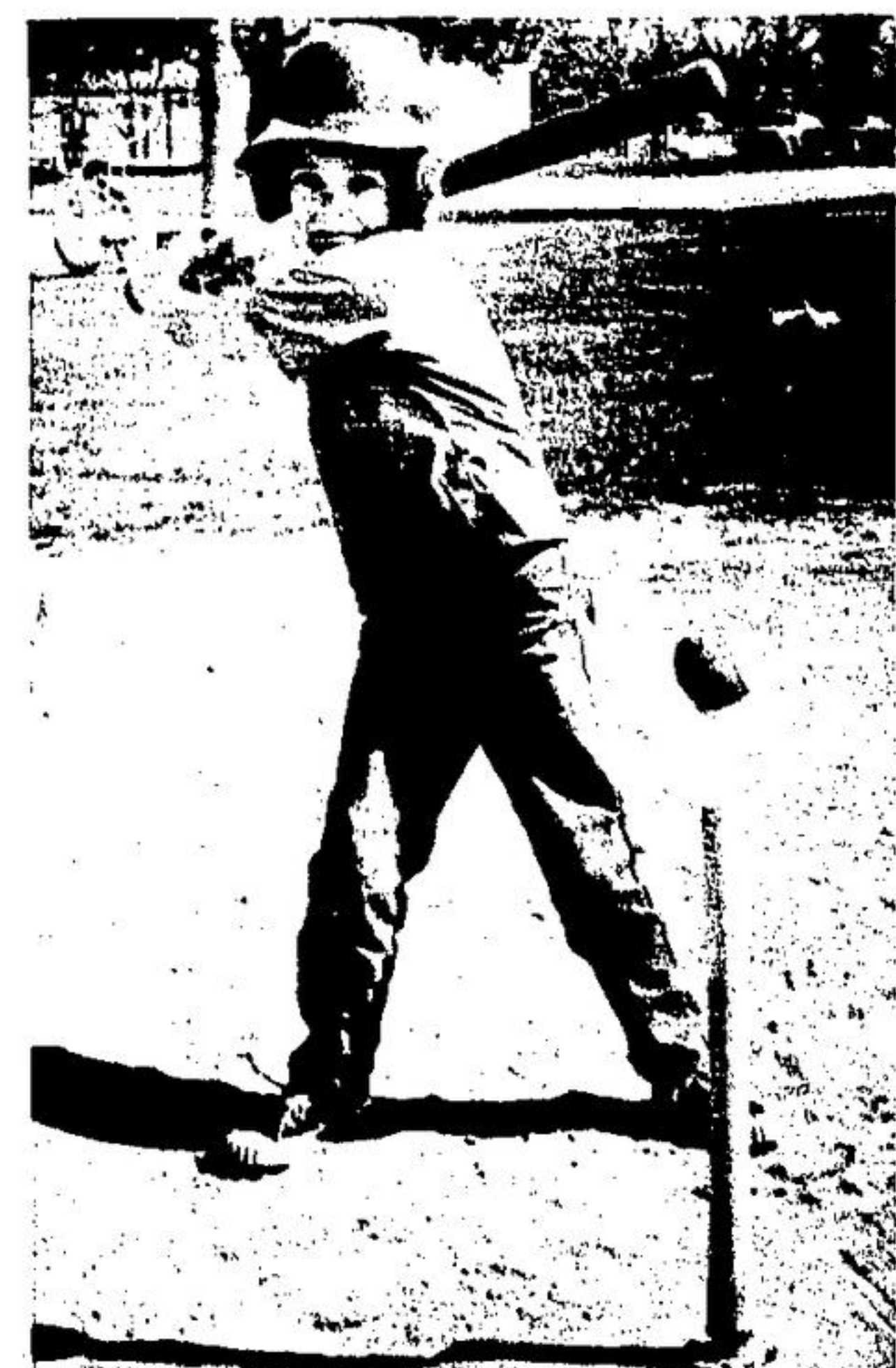
Tyke tees off on T-ball

Men's name brand, Mock Turtle KNIT SHIRTS Originally $6.00 now $3.00