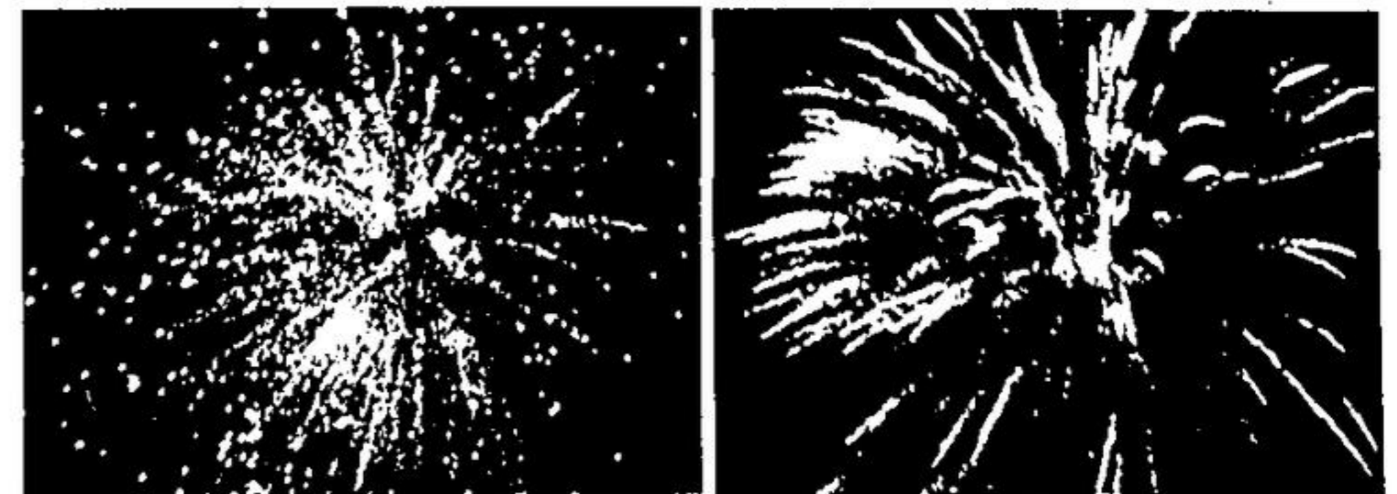
Children on the Front Page Were Looking at Fireworks

Highlight of the evening for most of the children was the spectacular fireworks display, which followed after dark. Under the supervision of Firefighter Herb Dodds, the brigade set off $500 worth of skyrockets, that drew plenty of "oohs" and "ahs" from the crowd when they exploded in the sky.