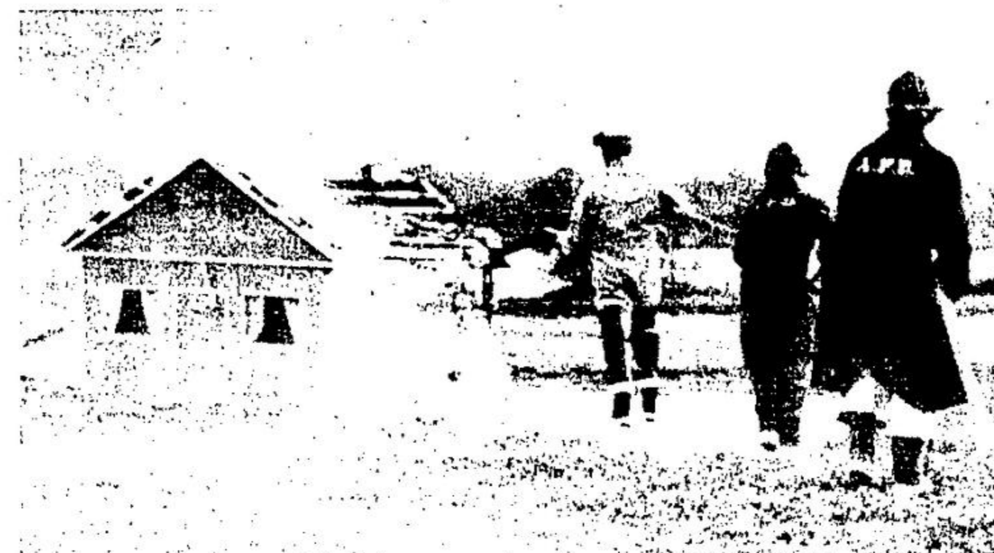
ACTON FIREFIGHTERS, along with Harry Ogden of Safety Supplies, showed the crowd at the Dominion Day firefighting display how they use foam to smother fires. It took them only a few minutes to smother this blaze, started in a model house.