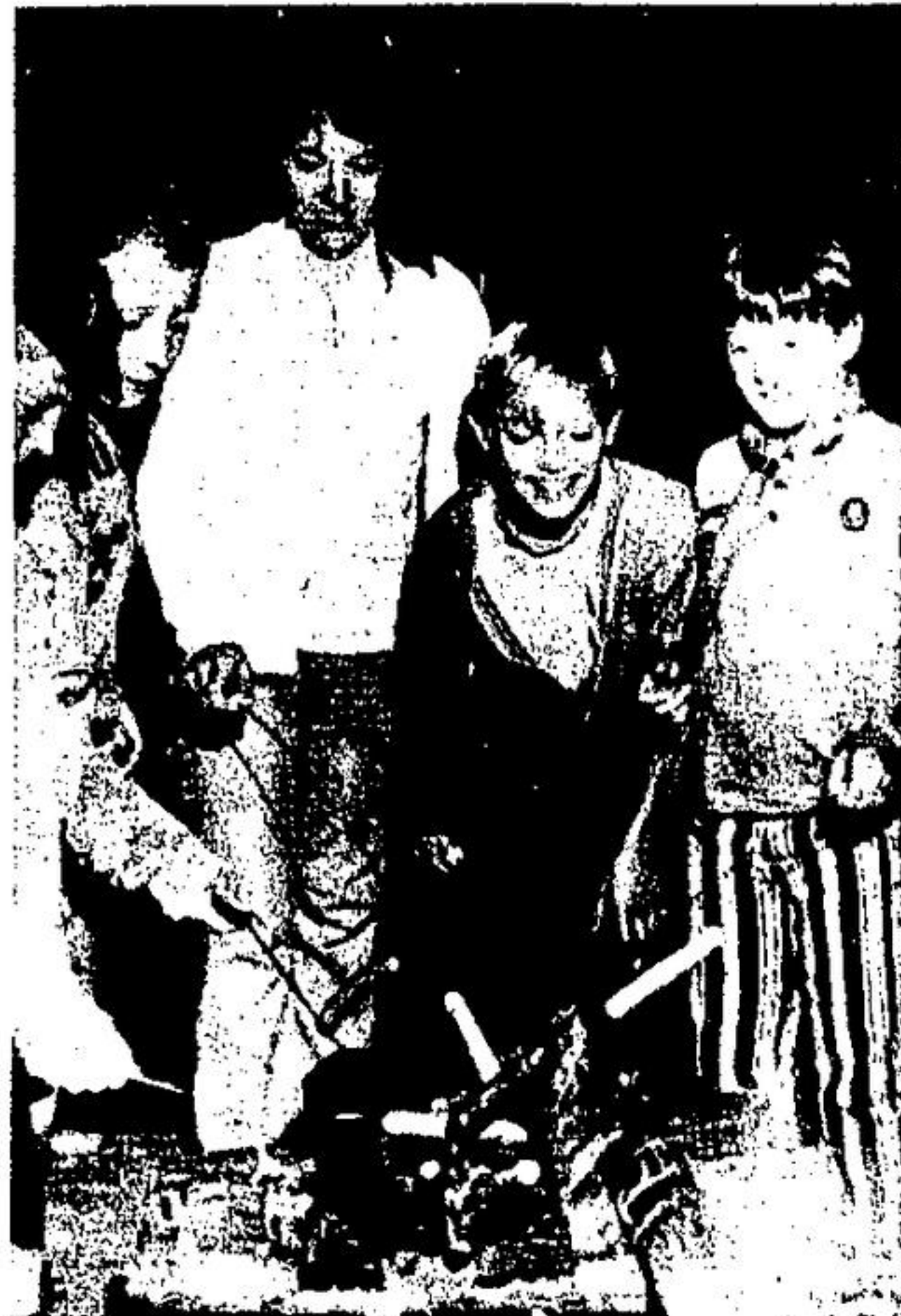
APPETIZING WIENERS roasted over the open fire were number one on the bill of fare as Acton Cubs and parents wound up the 70-71 Cubbing season Friday night.

Esquesing Council must submit detailed plans of operation, including provisions for depositing waste at the bottom of the grade, to the Waste Management Branch of the Department of Energy and Resources Management by July 15, if they plan to continue to dump garbage at their present