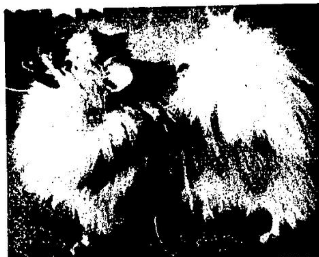
KILTY LANES' CHATTERBOX