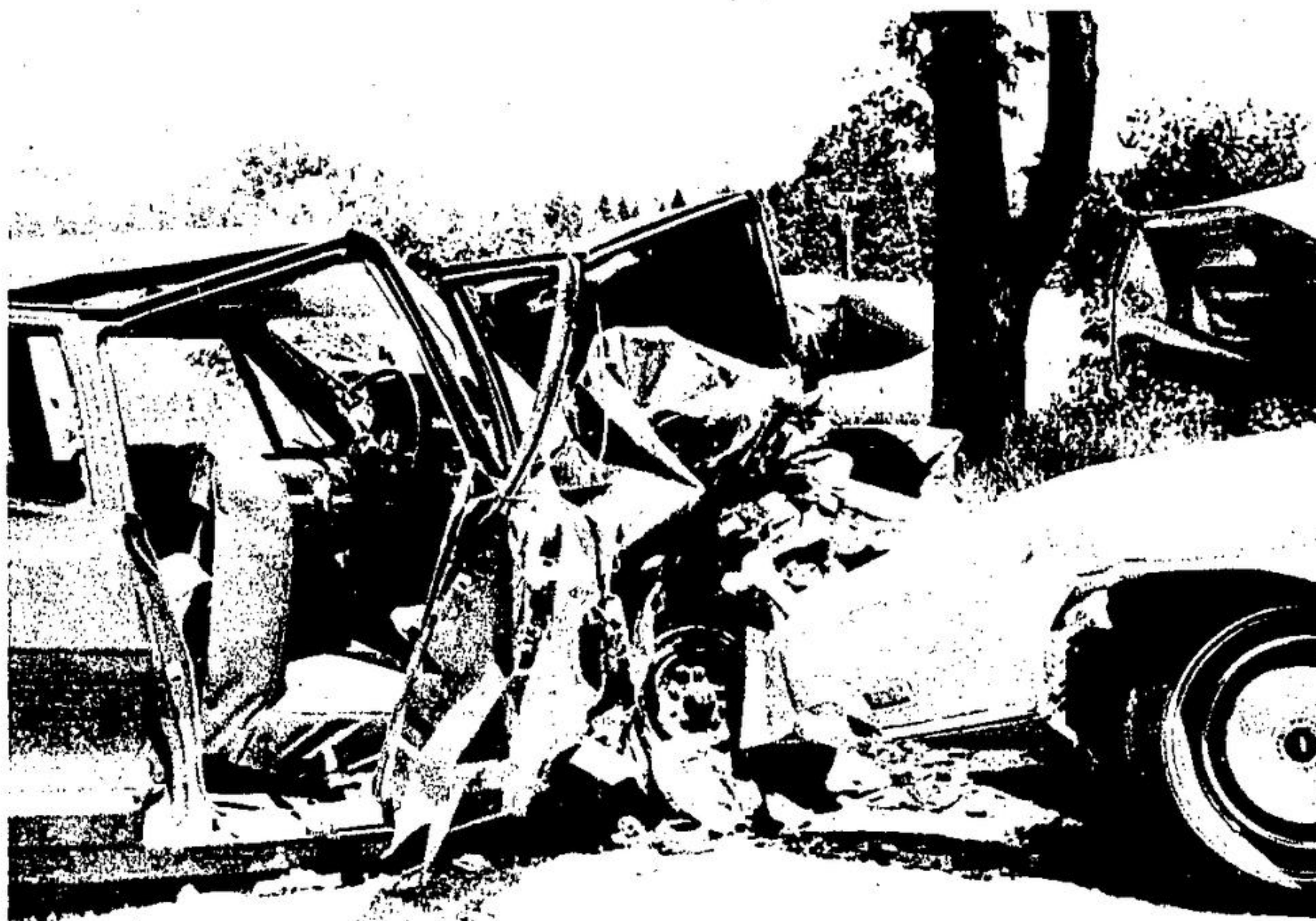
A HEAD-ON COLLISION on Highway 25 Saturday afternoon resulted in the death of an Acton woman and sent three other people to hospital with serious injuries. Two ambulances were

required to take the injured to hospitals in Burlington and Hamilton. Mrs. Julka Topolevec of Orville Road, Acton, was killed in the collision.