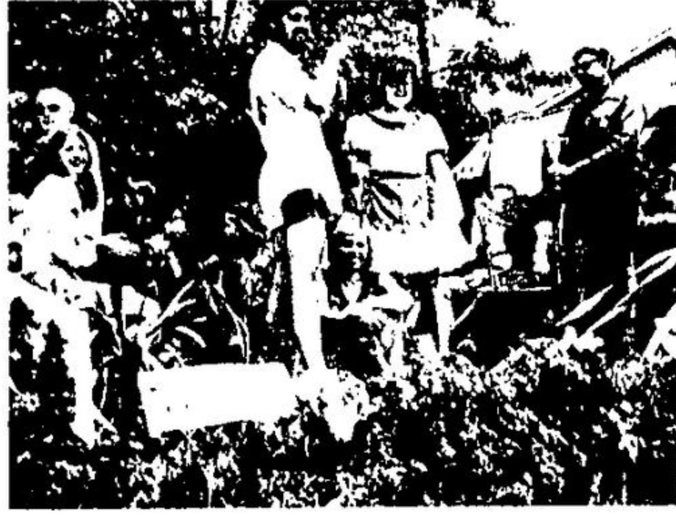
ERAMOSA JUNIOR FARMERS have a busy life. Their float proves it.