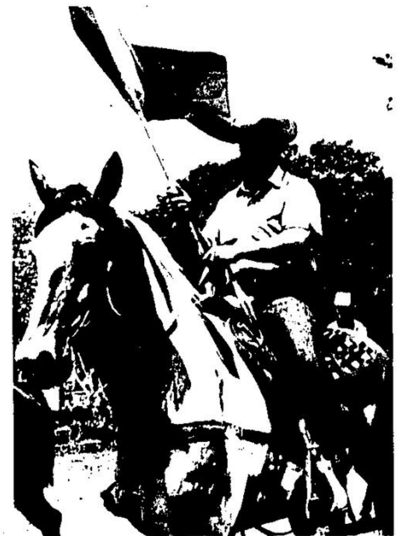
ROCKWOOD TRAIL RIDERS were a colorful part of the parade with several horses and riders.