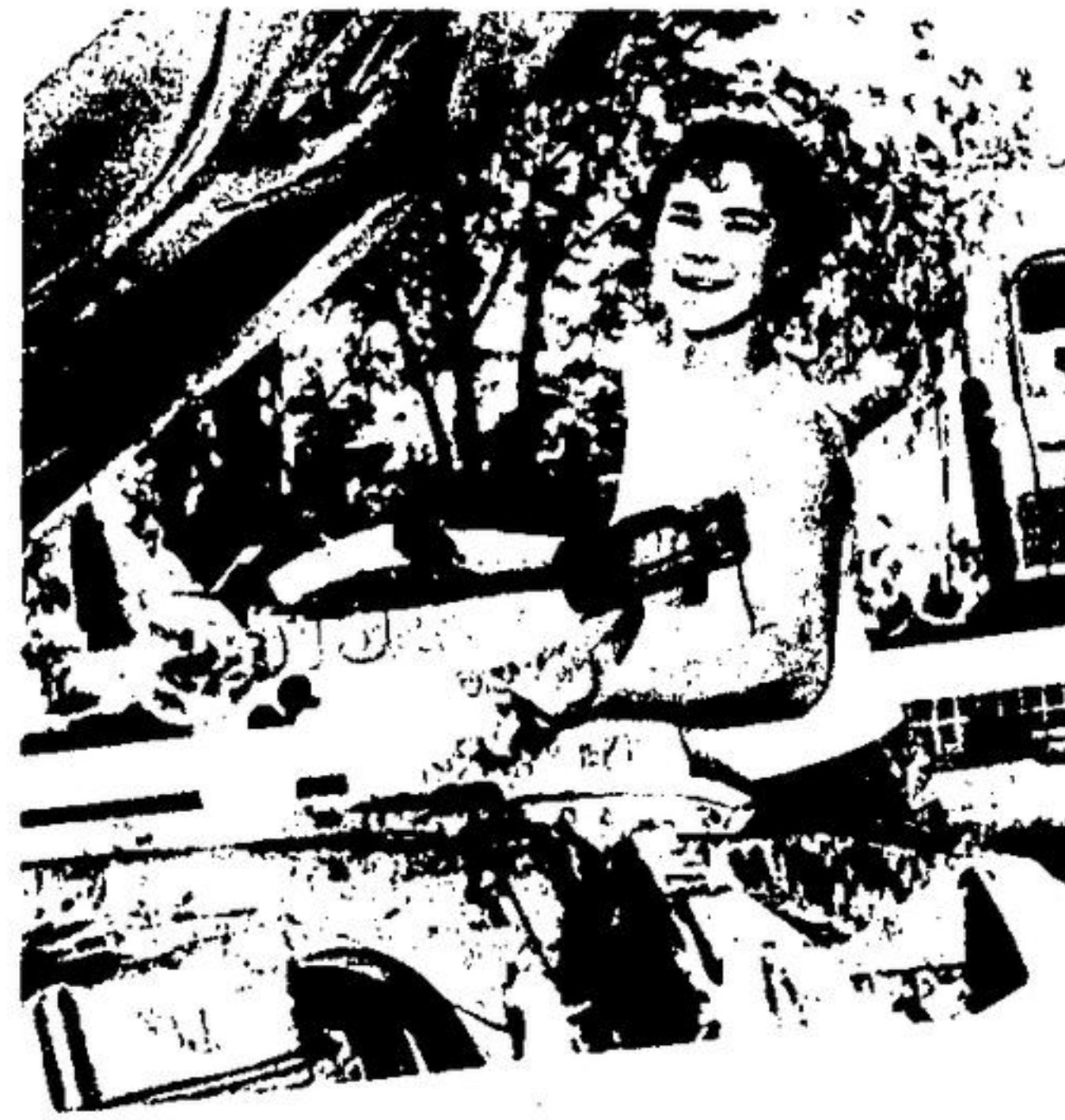
TAKING A WHACK at an old car with a sledgehammer was a favorite for youth at the carnival.