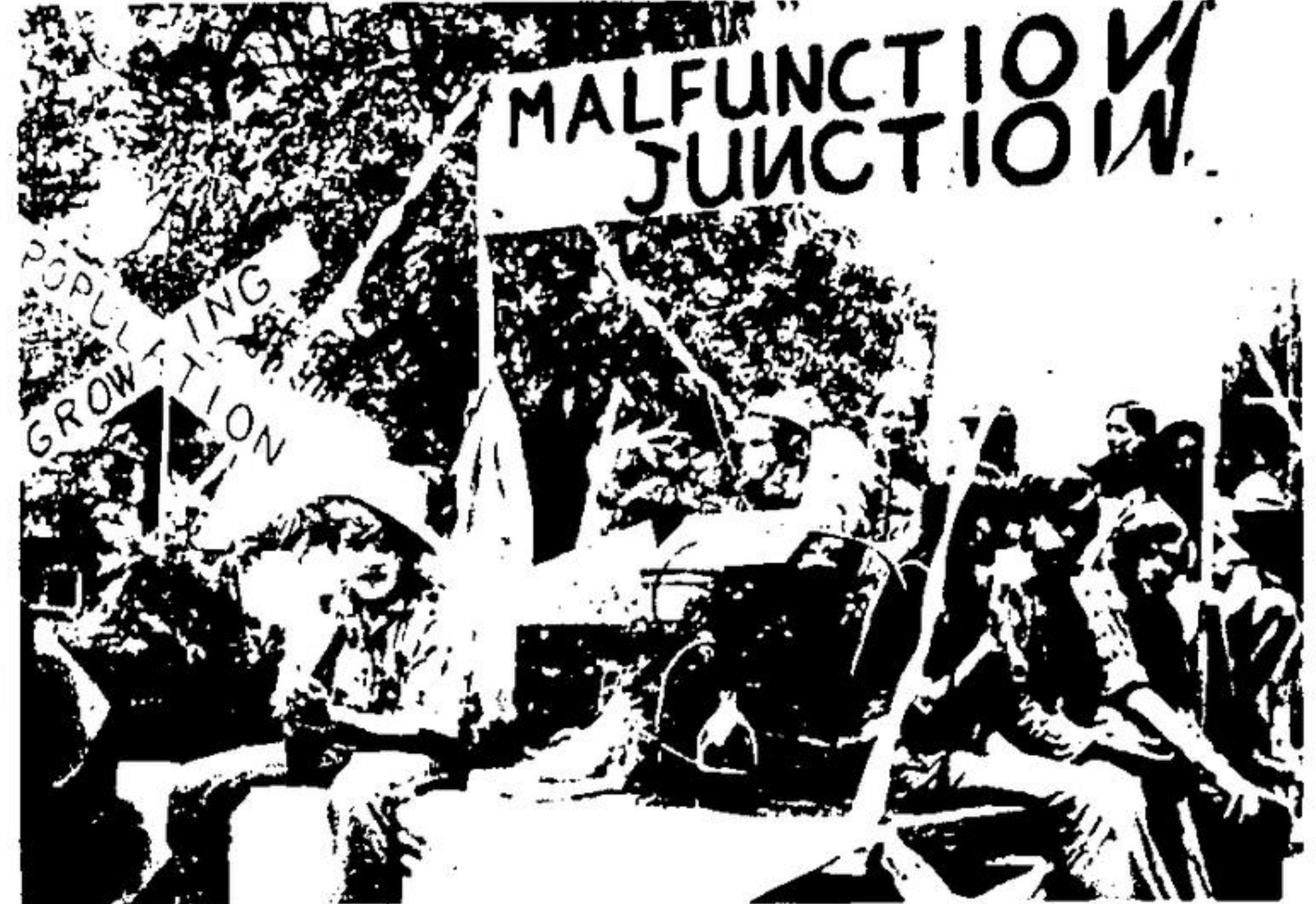
MALFUNCTION JUNCTION was a study in Hillbilly life for parade watchers.