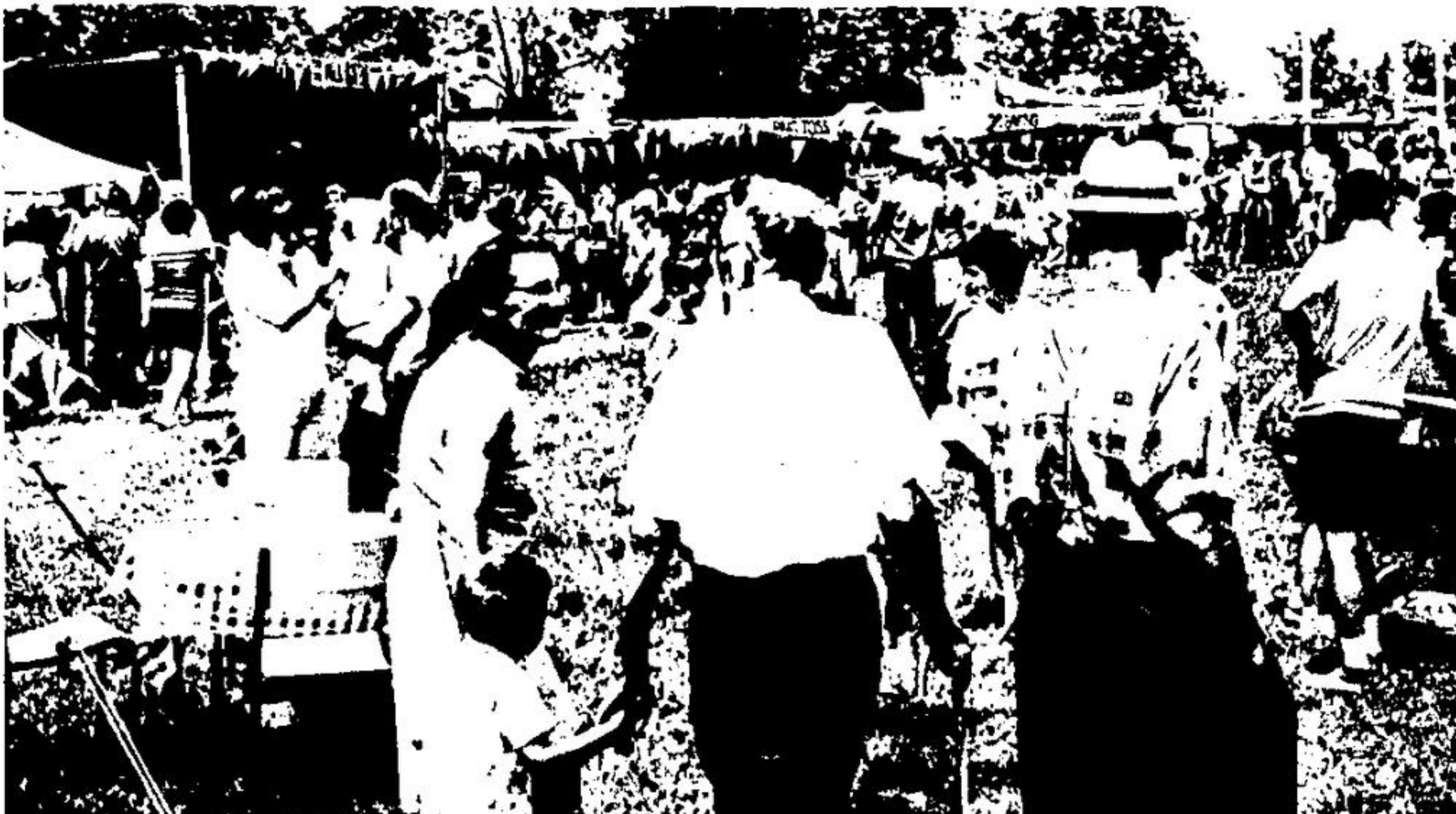
PART OF THE CROWD which thronged Rockwood Carnival Saturday afternoon patronizing booths, watching contests of