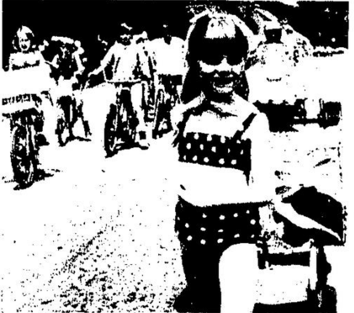
WHAT'S A PARADE without pets, decorated bicycles and a snowmobile on wheels?