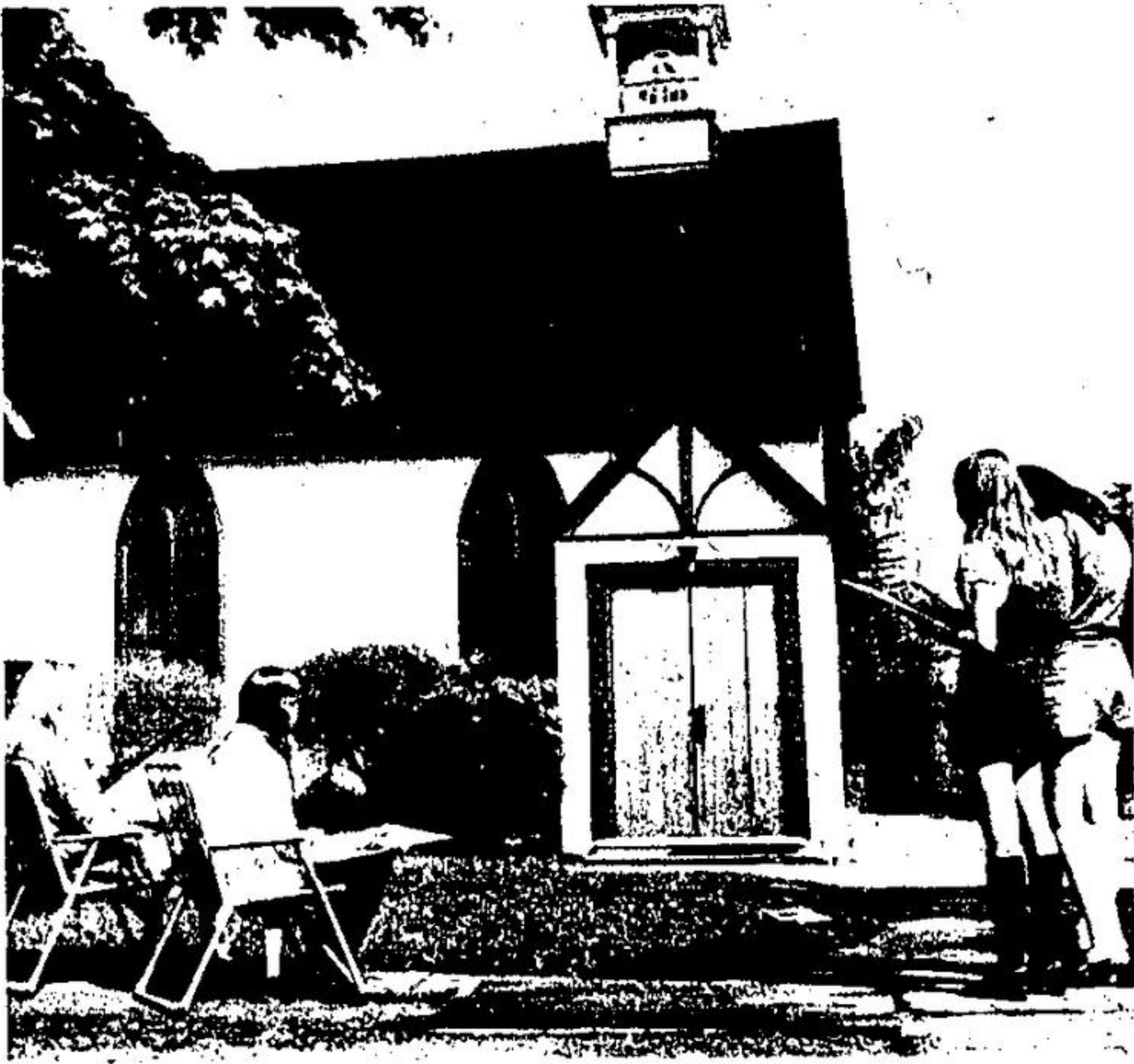
ROBERT LITTLE school students spent part of last week sketching historic buildings around town. This group of girls chose St. Alban's Church as their subject.