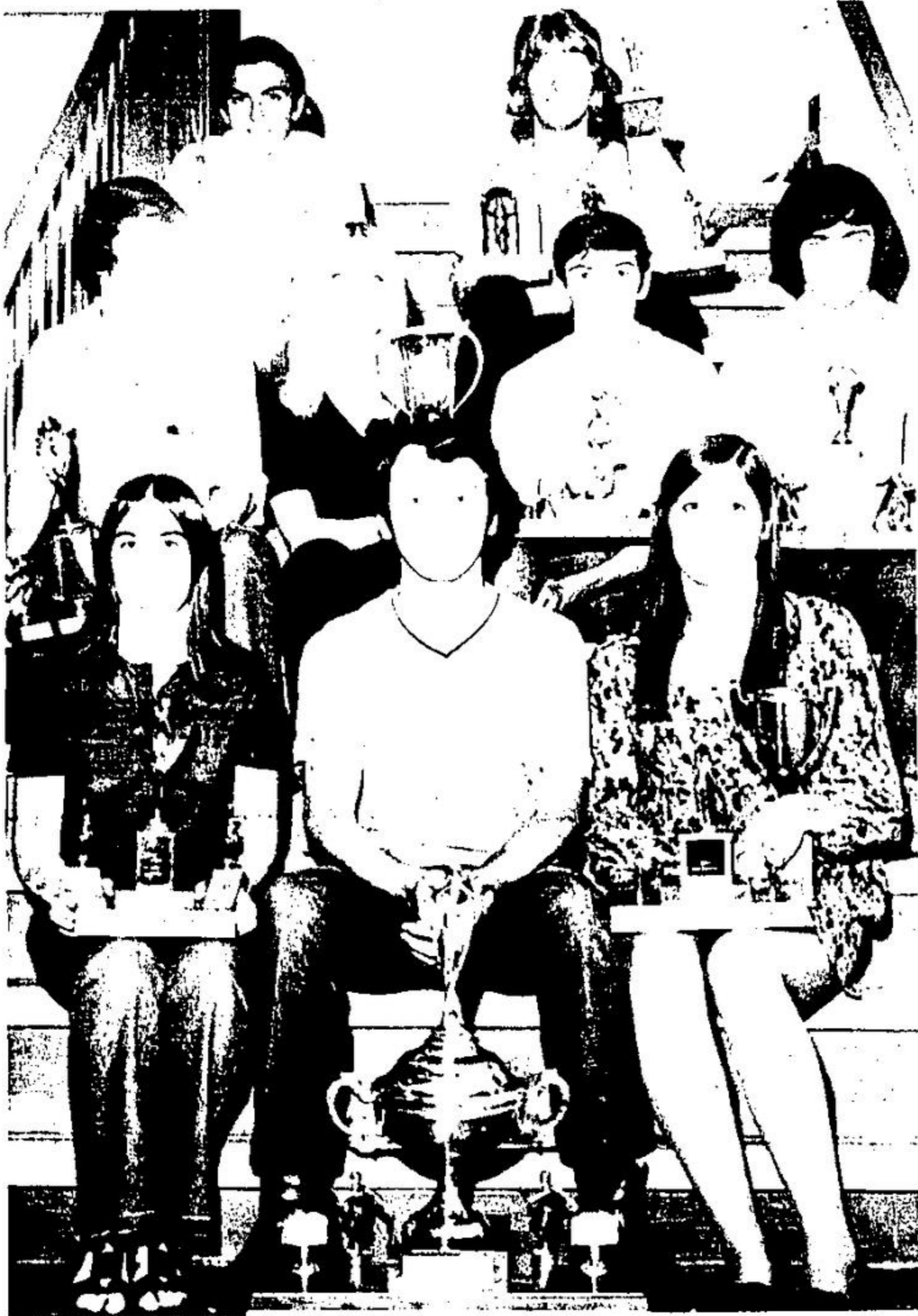
Outstanding students, athletes

For the '71 campaign, the CNIB is stressing the thought "Blindness is always sudden. Whether it begins gradually or happens overnight, the problems it creates are immediate. Prevention of blindness and rehabilitation or retraining of newly blind persons is a community problem, not an individual one."