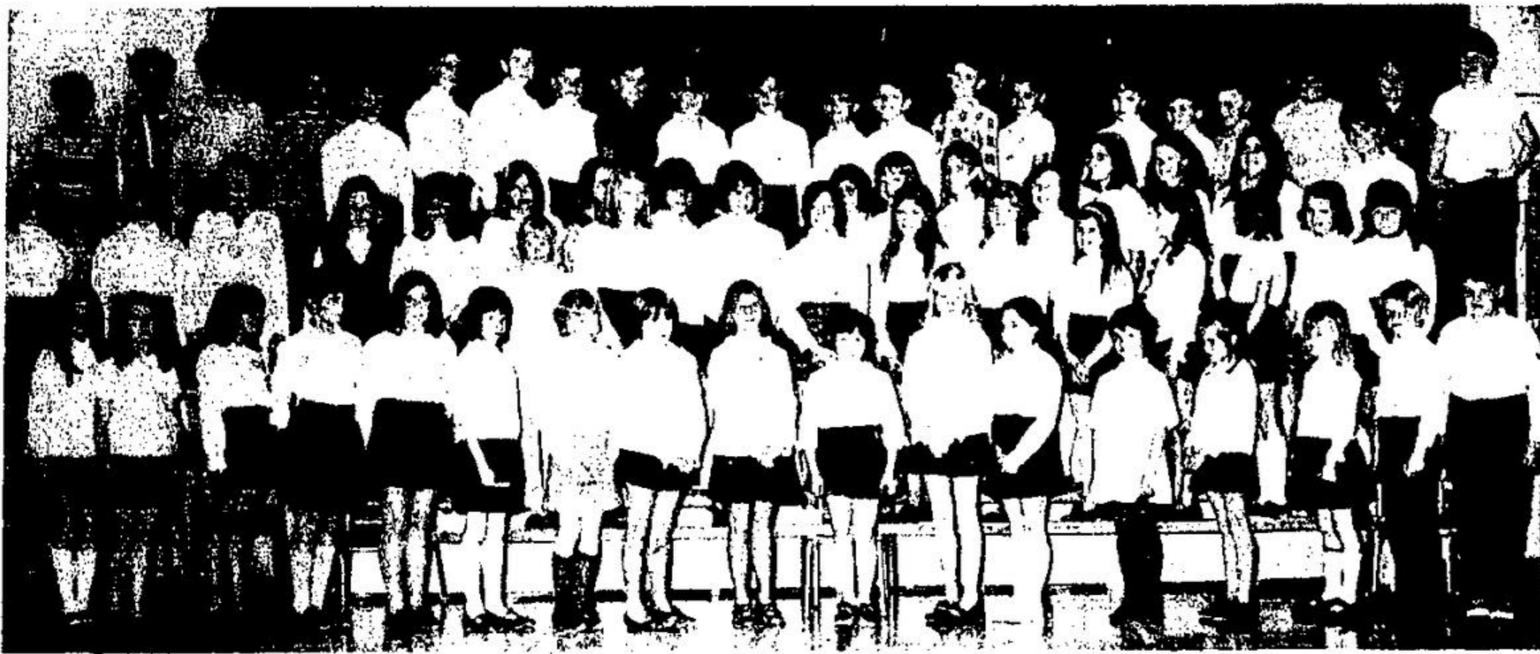
OSPRINGE SCHOOL CHOIR took high marks at the recent Kiwanis Festival at the Queen Elizabeth building in Toronto and has also entertained at several school functions. Leader is