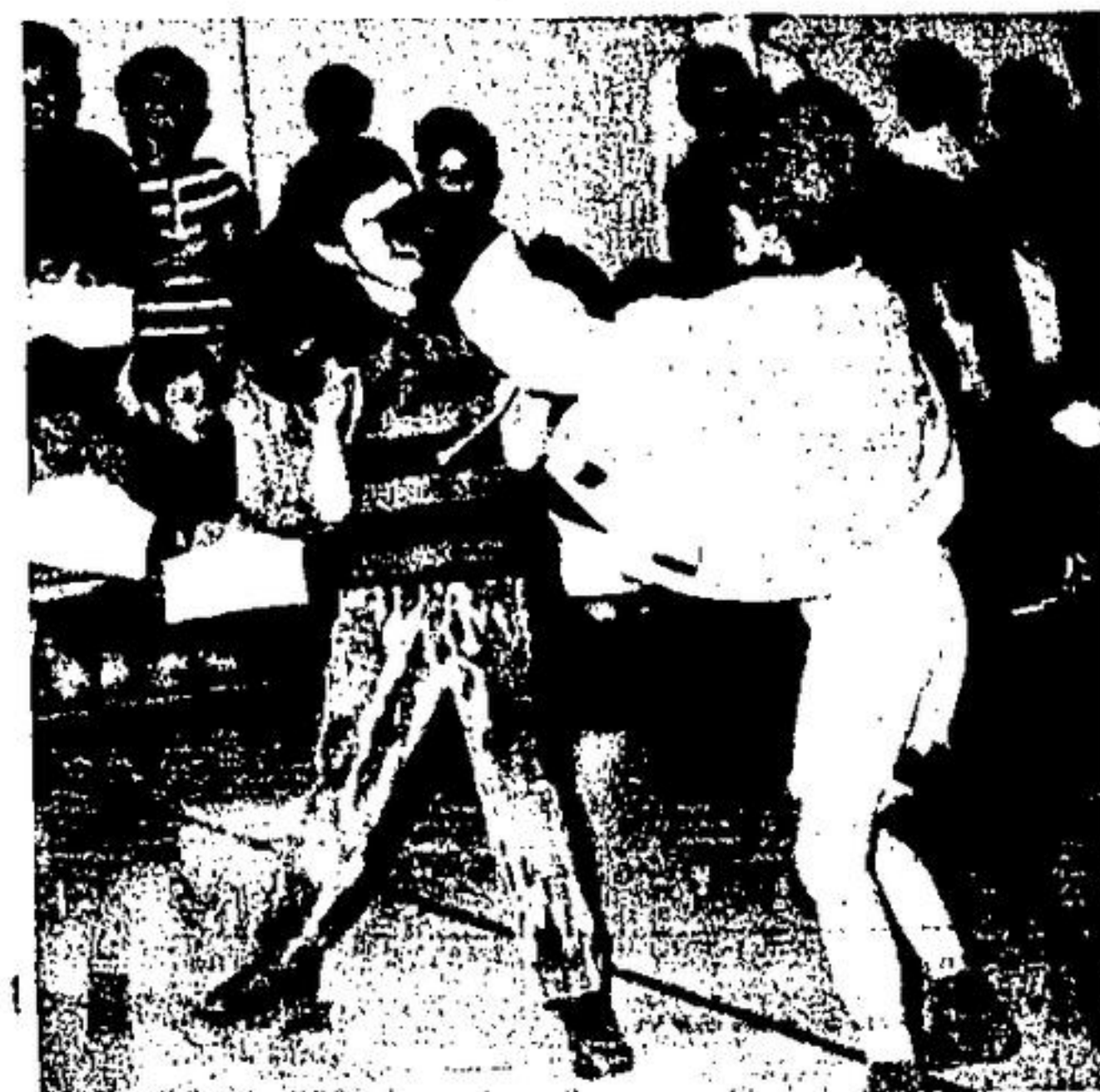
WHEN CLOWNS don boxing gloves anything can happen and in this case a looping left connects with a nifty nose. Both boxers were rewarded with cheers at the M. Z. Bennett circus.

Correction in the walkathon results: Mary Duiker walked the full 32 miles. Sorry.