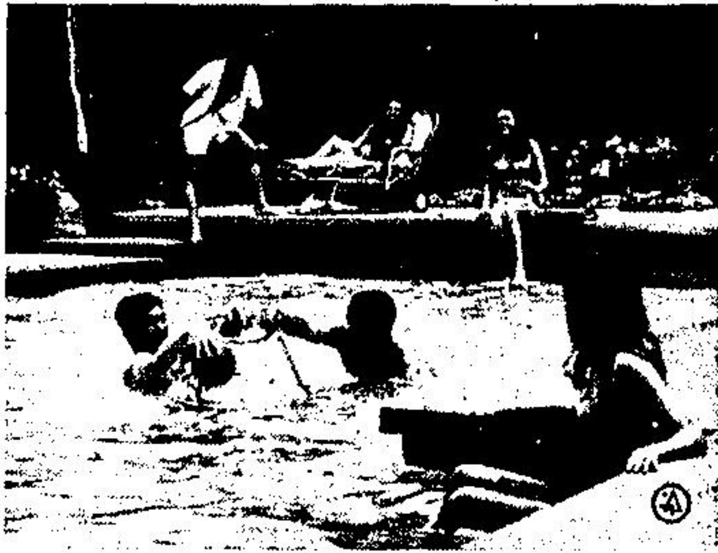
These swimmers aren't worried about ice-cold water ending their fun. The pool is equipped with a gas water heater, and the water stays comfortable even on cool days and chilly evenings.

Accurate heater sizing, the American Gas Association stresses, is important for getting the best buy in a gas water heater. A heater that is too big for the pool is a waste of money. A heater that