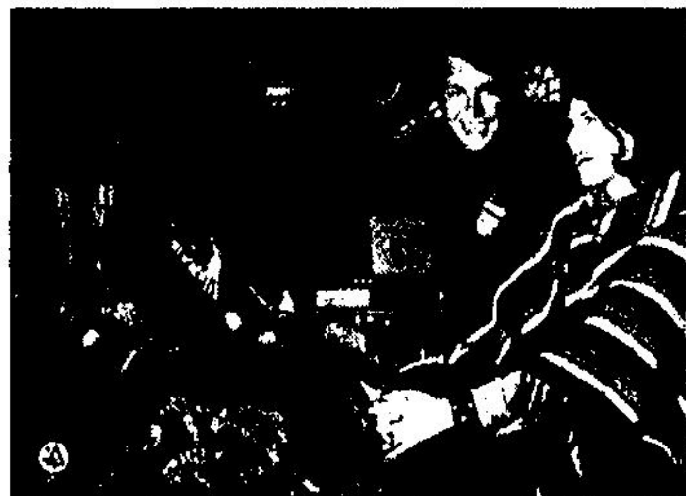
Campfire sing-alongs will be remembered long after the fire burns out if you preserve forever those moments with pictures and tape recordings. The ideal camera is the Kodak Instamatic X-35 Camera.