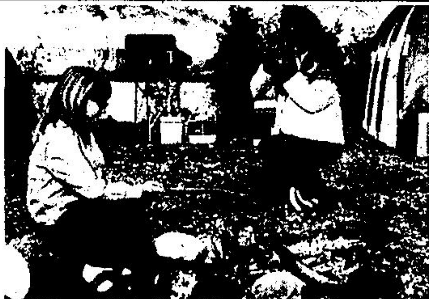
Hot dog roasts, a child's candid reactions to camping in the Great Outdoors, are easy to film with today's quick-load, no-fuss movie cameras. Shown here is the Kodak Instamatic M24 Movie Camera.