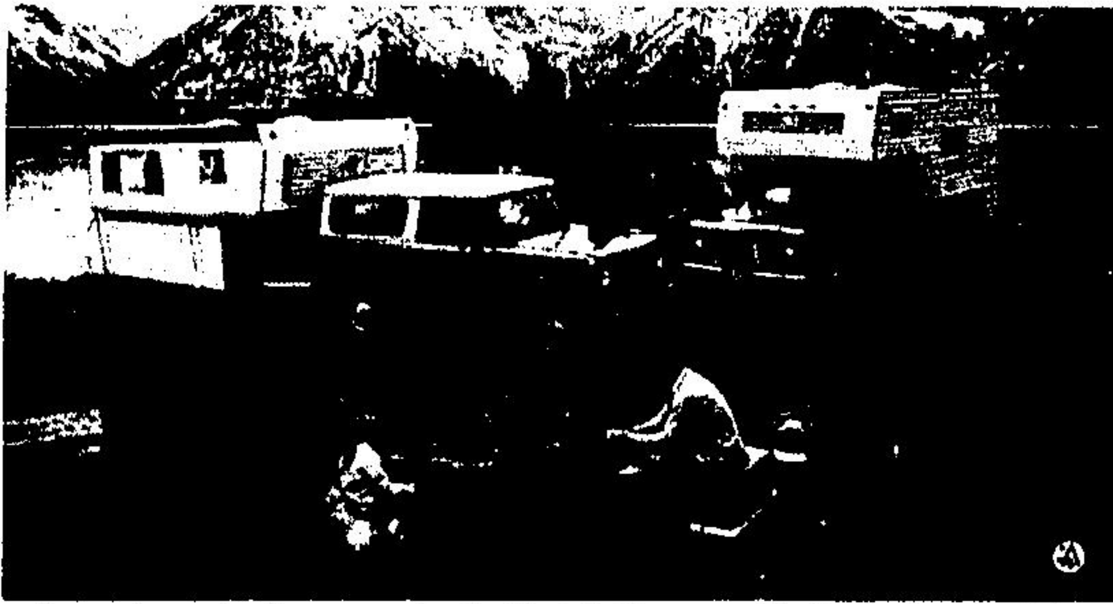
More and more families are roaming the Great Outdoors — and finding the type of vehicle to match their carefree living needs.