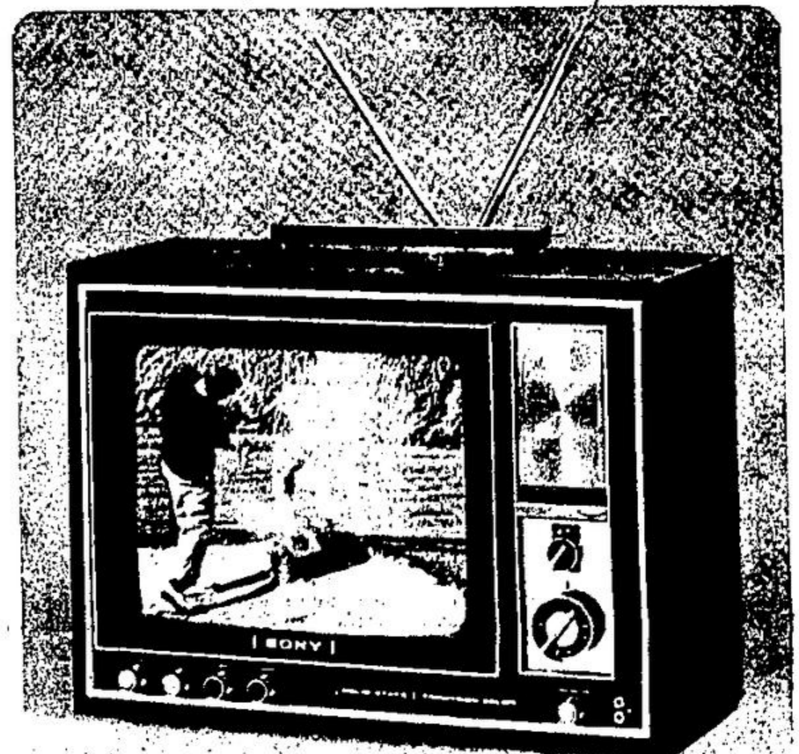
Simulated TV Reception

—Also Available— Sony 5 Inch AC-DC Operated Black and White Portables