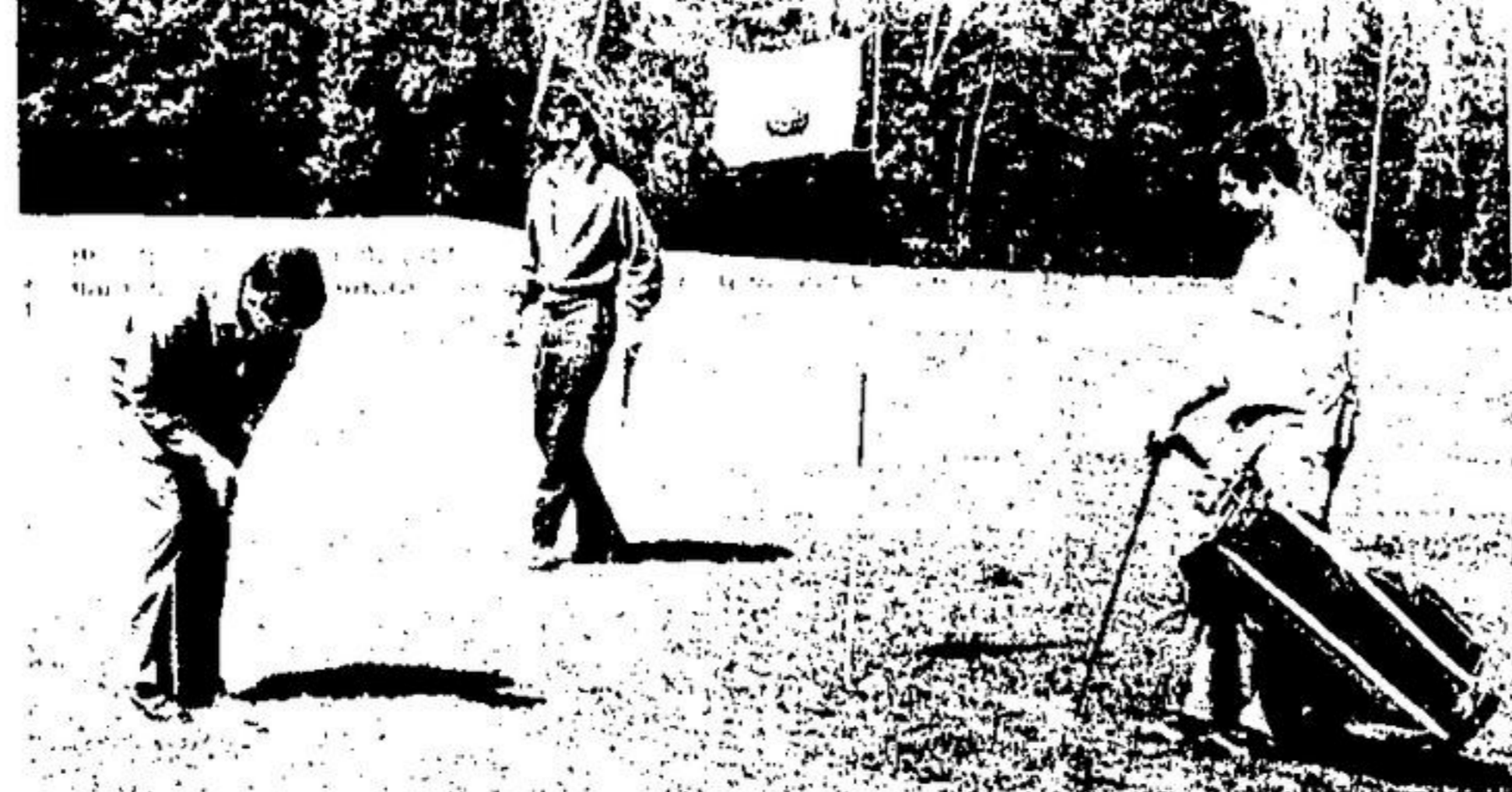
ACTON MEADOWS GOLF Course, on the First Line west of Acton opened officially under sunny skies on the weekend. Although all greens, including the ninth shown in this photo are not yet in use, fairways are in