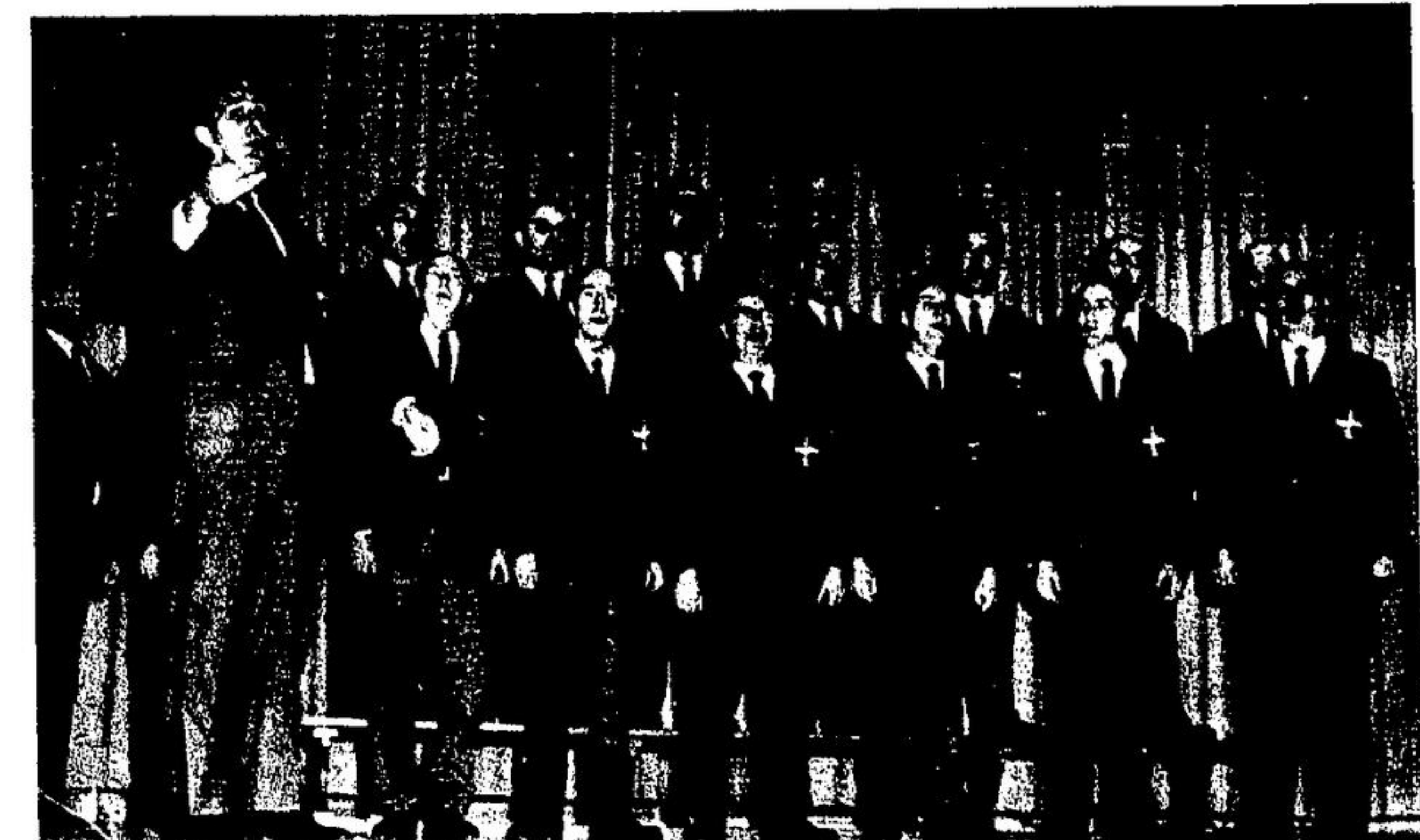
GEORGETOWN Barber Shop Quartet were very popular with the audience at the Variety Show.