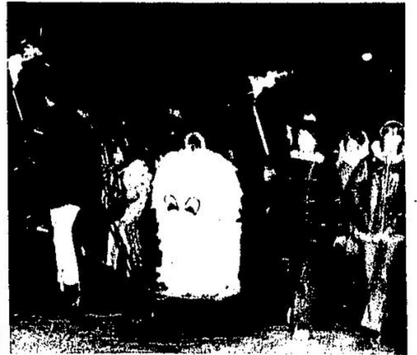
STUDENTS pulled along the Ookpik symbol at the head of Tuesday's parade.

Normal public school pupils joined in the fun and many adults lined the torchlit route. Judging for best float and Carnival Queen followed at the high school.