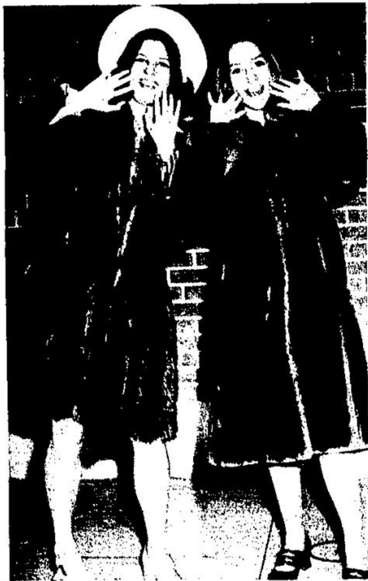
MORE PRETTY GAL'S

starred Doris Dwy. Some humorous episodes about elevators and subways without power were included. It was a good movie and was enjoyed by all present.