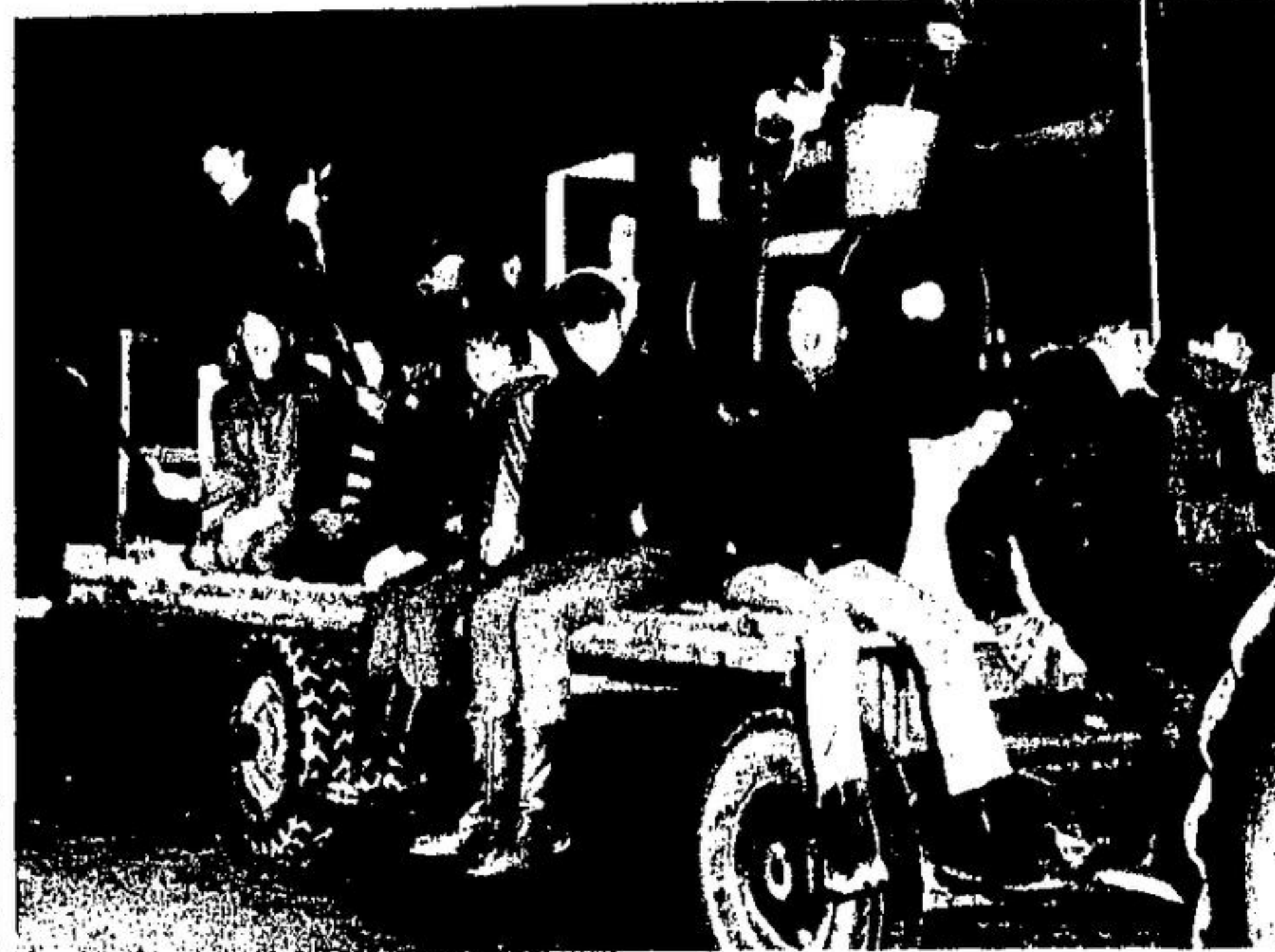
GRADE 10 students won first prize for their steam engine float.