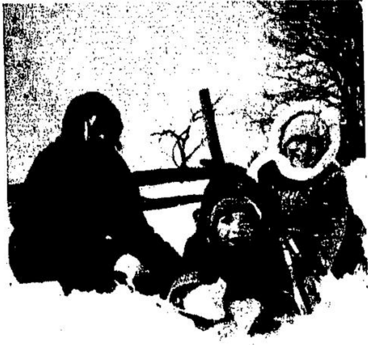
WINTERTIME at Eden Mills and 11-year-old Cathie Adair and younger sister Barbie 7, push 6-year-old Matthew Bould down a hill on his red flying saucer.

At long last Signs were erected last week on highways 25 - indicating road under construction - in preparation for clearing. At long last, work is to be proceeded with on this busy piece of road.