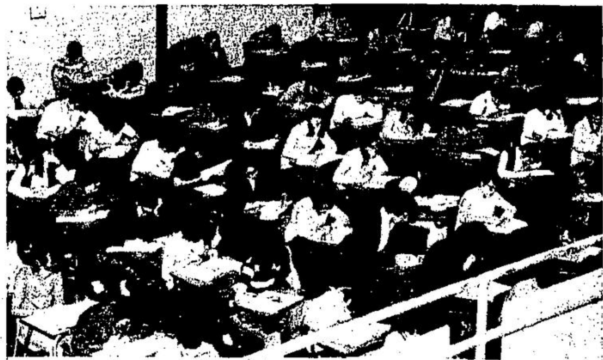
PROBABLY FOR the last time, Acton District High students are writing school examinations in the gymnasium this week.