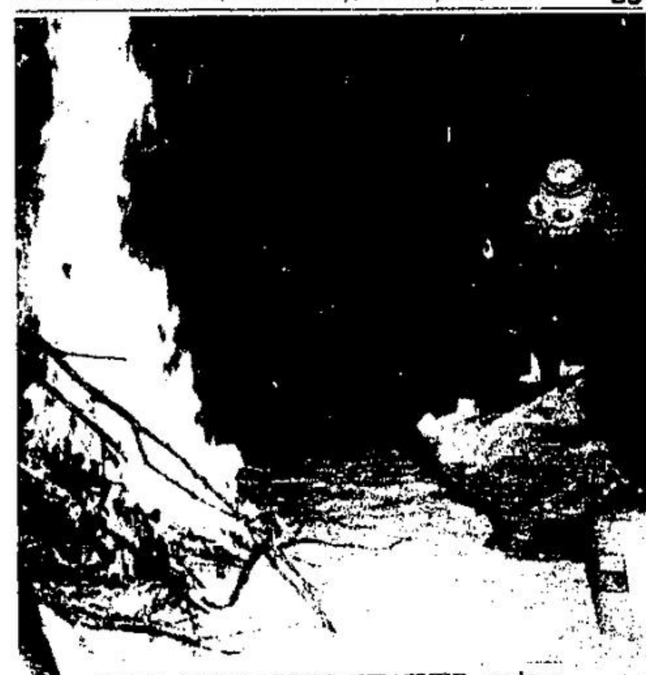
CRISP, BELOW ZERO WEATHER made a perfect night for the annual Christmas tree burning at Eden Mills Saturday, sponsored by the Community Club of the village. One of the youngest spectators came in a sleigh with her mother and gazes in wide-eyed wonderment as flames leaped into the sky and snowmobiles roared past with loads of children. Also among the vehicles which joined the annual celebration was a dune buggy with a pair of passengers behind.

equipment has been donated. A good membership is expected. Saturday evening a large crowd gathered at the park for the annual tree burning which included skating, skiing, and snowmobiles, a plenty with rides to be had for the asking. The ladies in charge of the booth were kept busy making hot chocolate and serving doughnuts which were provided by the Community Club.