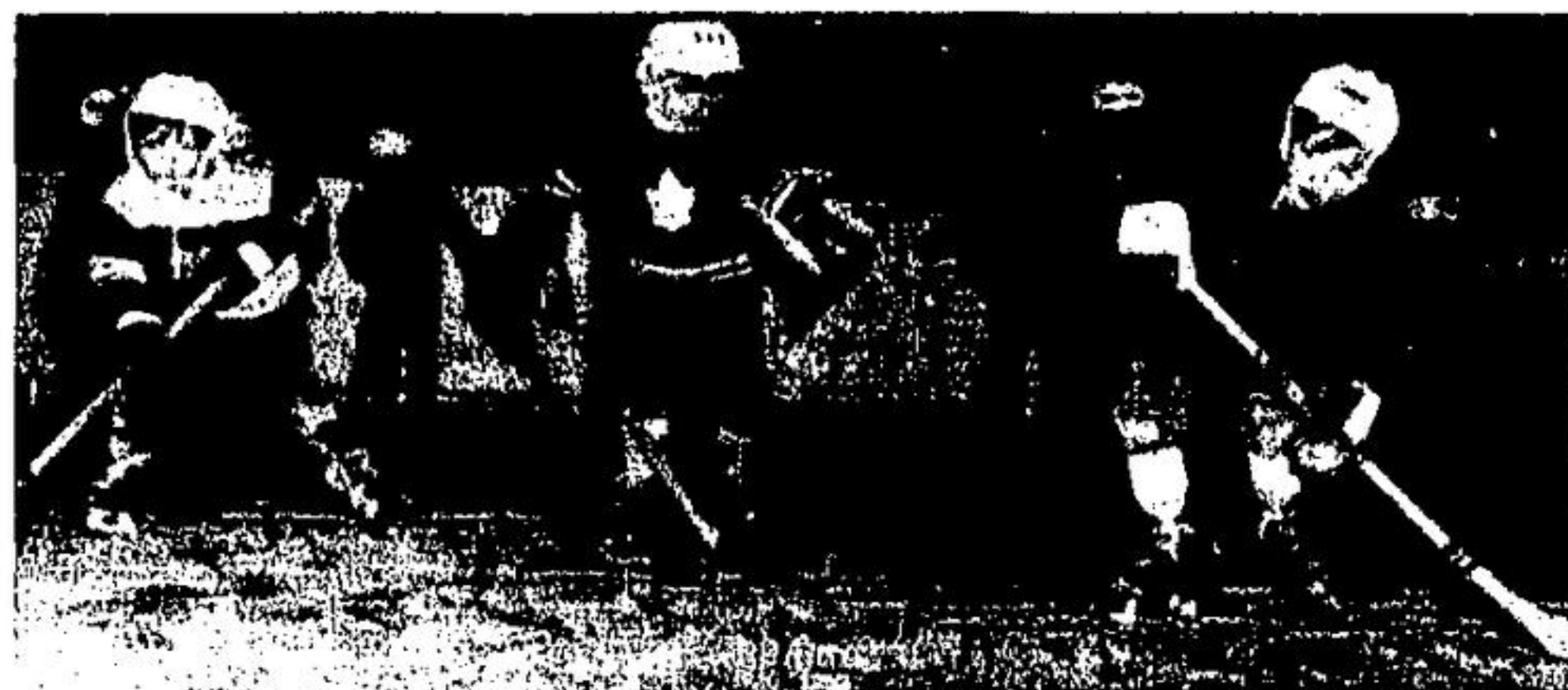
BEGINNERS give it their best effort during their time on the ice.