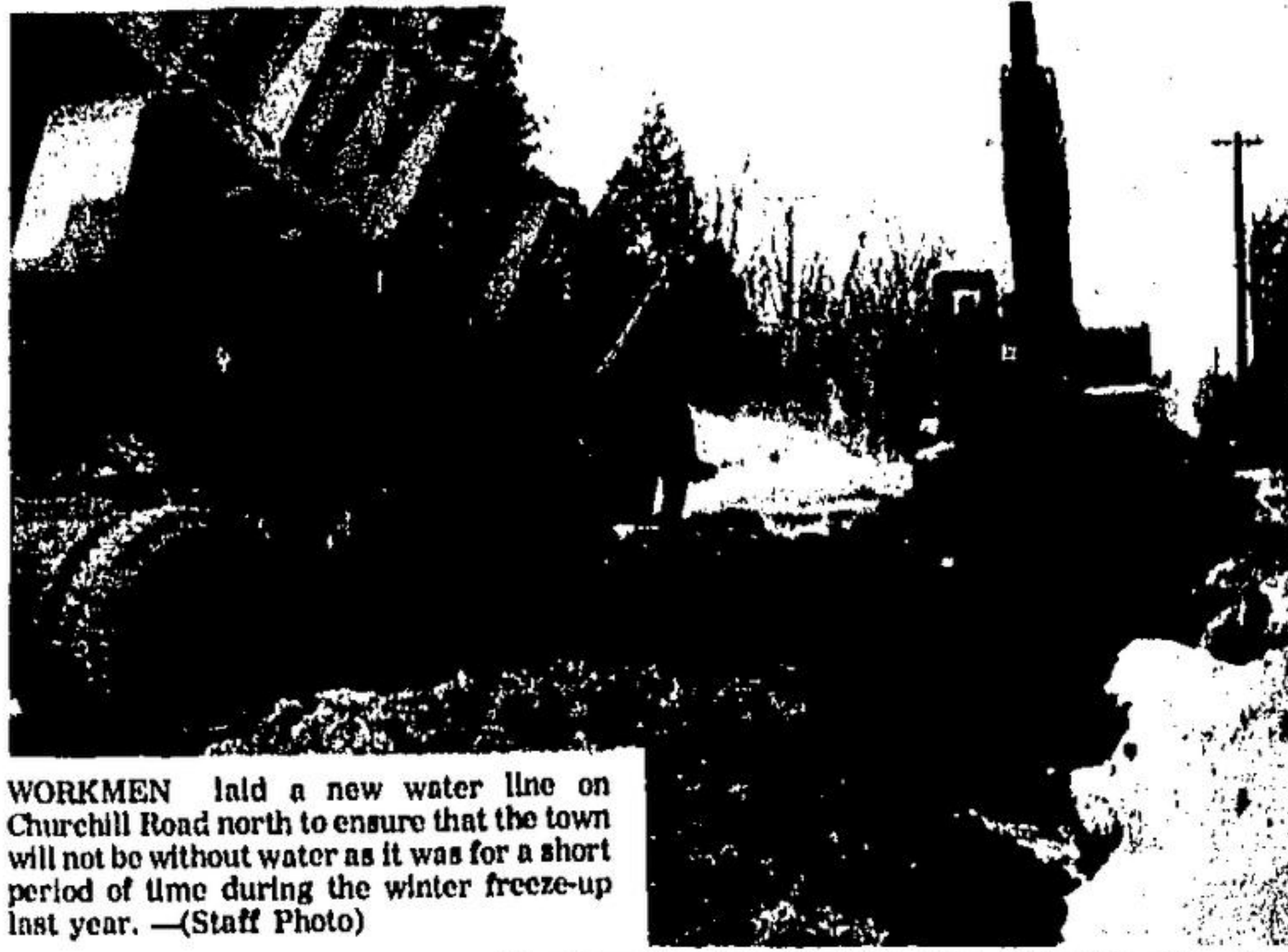
WORKMEN laid a new water line on Churchill Road north to ensure that the town will not be without water as it was for a short period of time during the winter freeze-up last year.

(The above article is a revision of the article which appeared in "Evening World" a newspaper in Spencer, Indiana, Oct. 10, 1969.)