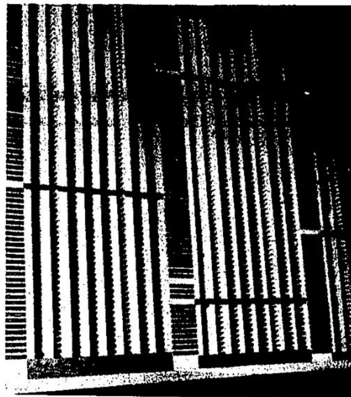
SOME IDEA OF the number of notes you can hit on this newest Keates organ console can be gained by a view of labelled circuits.

about declaring this was the largest organ console ever produced in Canada, but had no compunction about saying it is the largest built in this country in the last decade. But in the tradition of skilled workmen around the globe, it is not the size the Acton company is most proud of, but the special brand of Keates craftsmanship that went into the instrument. Keates Organ Co. Ltd., came to Acton from Lucan over eight years ago and is located in the industrial centre at the south end of Frederick Street.